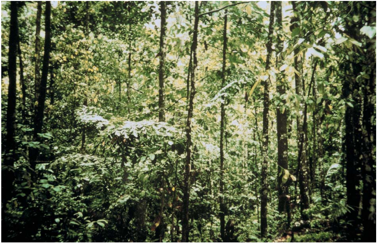
Figure 4. Twenty-year-old restored forest. It will be many more years before this provides natural holes and cavities for owl to nest in. Los Banos Botanical Gardens, Luzon, Philippines (photo T. Warburton).

them in a broad range of initiatives will in the long run, bring greater benefits than excluding them. These should include the development of ecotourism to highlight the value of conserving the forests and their unique wildlife. Such initiatives can help to improve the livelihoods of local populations and demonstrate how sound use of their natural resources can generate a sustainable source of income.