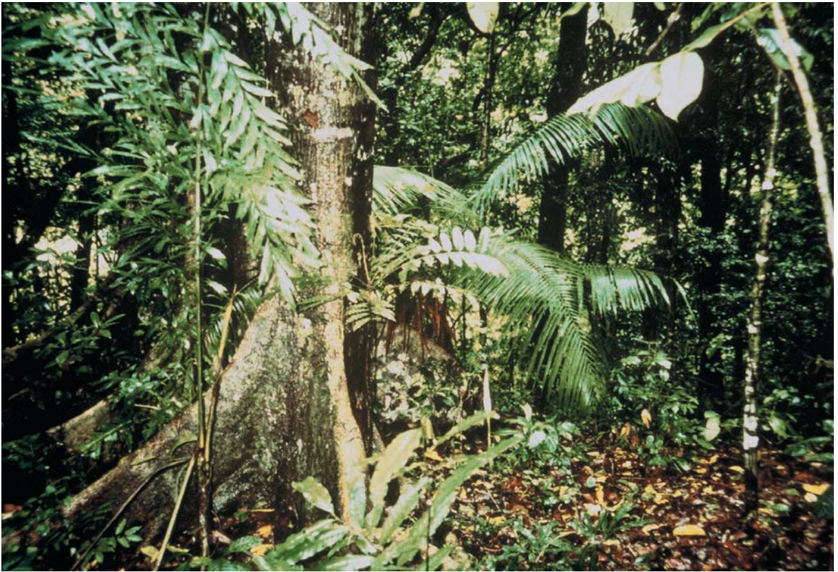
Figure 2. Old-growth forest, typified by giant-sized, buttress-rooted Dipterocarps once covered virtually all lowland areas of the Philippines. Less than 10% now remains. Mt. Makiling, Luzon, Philippines.

throughout the 1960s and 1970s, that by the 1990s the Philippines were forced to start importing logs for their own use! Islands such as Cebu, Masbate, Guimaras and Ticao are now virtually denuded, while on Panay, Leyte, Negros, Bohol, Mindoro and Polillo only tiny fragments of forest are left, most of it at higher elevations. Only Samar and the major islands of Luzon, Mindanao and Palawan have reasonable areas of lowland forest remaining. Put quite simply, the rate and size of forest destruction throughout the Philippines has resulted in virtually all of the remaining areas of lowland forest being too small to maintain viable minimum numbers of species, with 'kaingin' (slash & burn) subsistence farming, continual illegal hunting, mining and resultant inbreeding all causing an overall reduction in genetic diversity (Fig. 3). Ultimately this will inevitably result in the extinction of many endemic species – including owls.