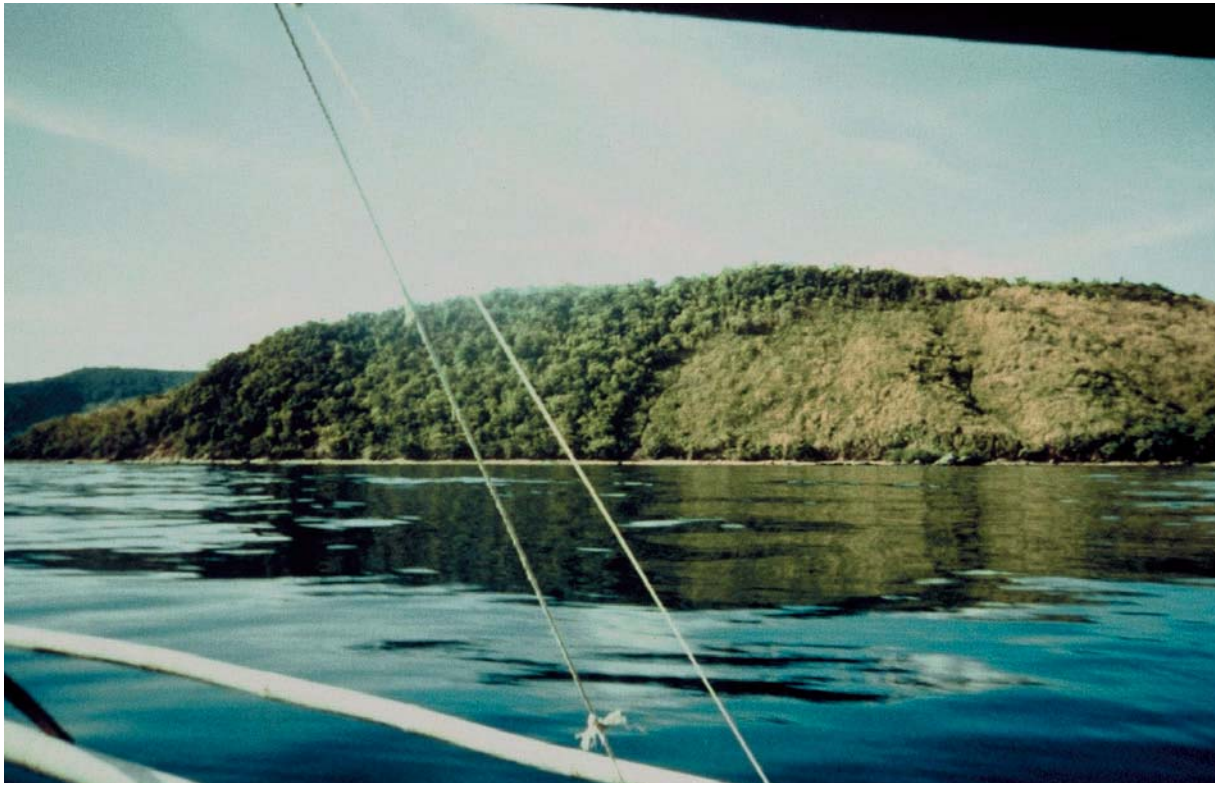
Figure 3. An example of clear-felling (right-hand hillside) resulting in habitat fragmentation. Busuanga Island, north of Palawan, Philippines.

wrote “unless immediate and urgent action is taken, not only birds but all other Philippine wildlife species are likely to become threatened or even extinct.”