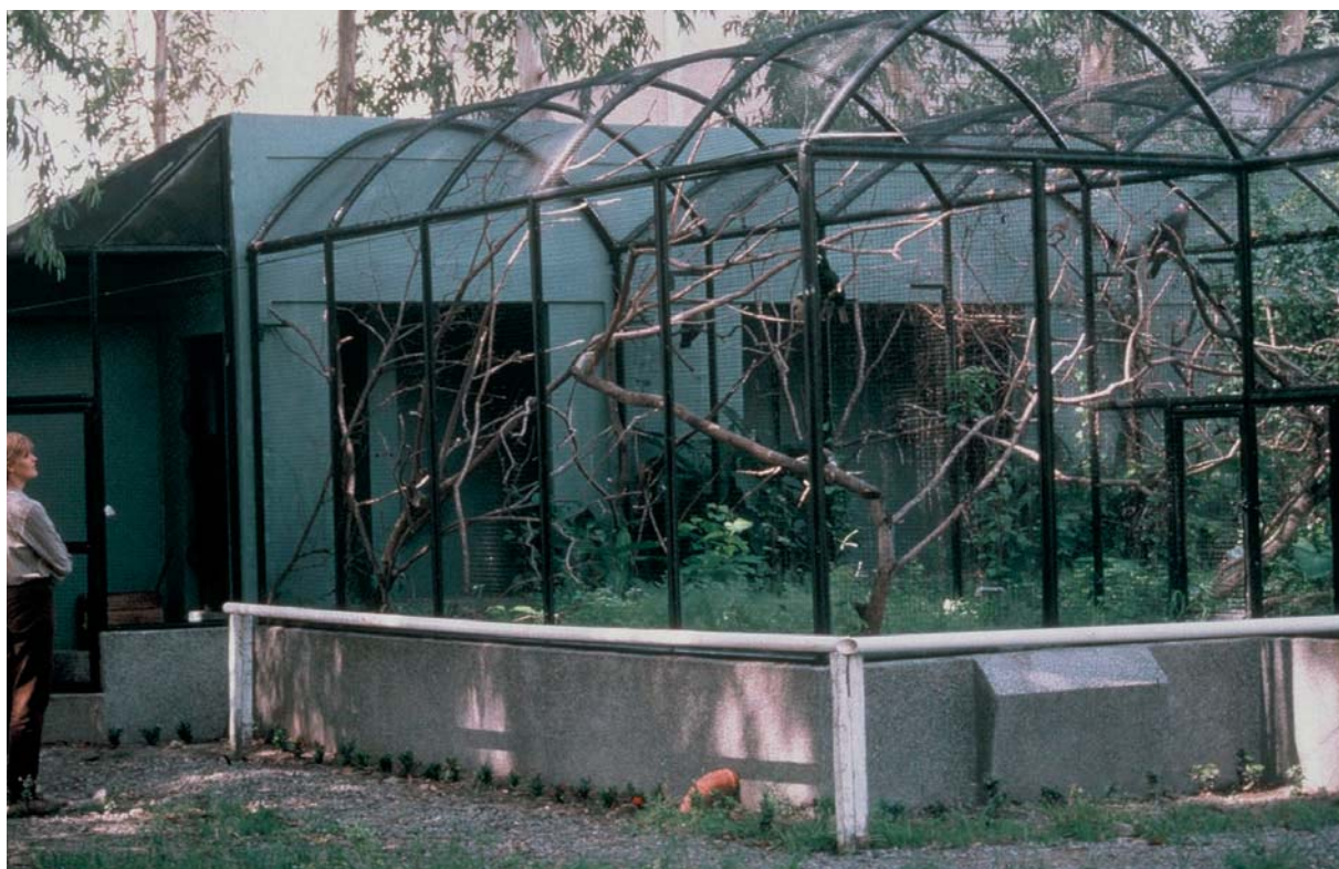
Figure 5. Breeding aviaries for Philippine Eagle Owls, sponsored by the World Owl Trust. NFEFI-Biodiversity Conservation Centre, Bacalod, Negros Occidental, Philippines.

must also have been eliminated. For instance, one of the most serious problems facing almost all of the Philippine owls is the lack of nesting holes due to the disappearance of large trees. In the face of continuing habitat loss and virtually non-existent protection, it therefore seemed prudent to set up in situ conservation-breeding programmes for endangered owls to at least safeguard some of the endangered species/subspecies and create opportunities for Filipino nationals and ourselves to learn more about them and hopefully provide us with the knowledge we can use to help them in the wild. The first difficulty lay in finding a centre which could be open to local people in order to encourage their interest and education. Unfortunately, most existing Philippine zoos and ‘rescue centres’ were at that time far from ideal for a variety of reasons, and in the end we chose to forge links with, and support, the Biodiversity Conservation Centre created in 1977 by the Negros Forests & Ecological Foundation at Bacalod, Negros Occidental (NFEFI-BCC) (Fig. 5). The objective was to develop a world-class conservation, research and educational centre with the aim to conserve the depleted populations of endemic species found only on