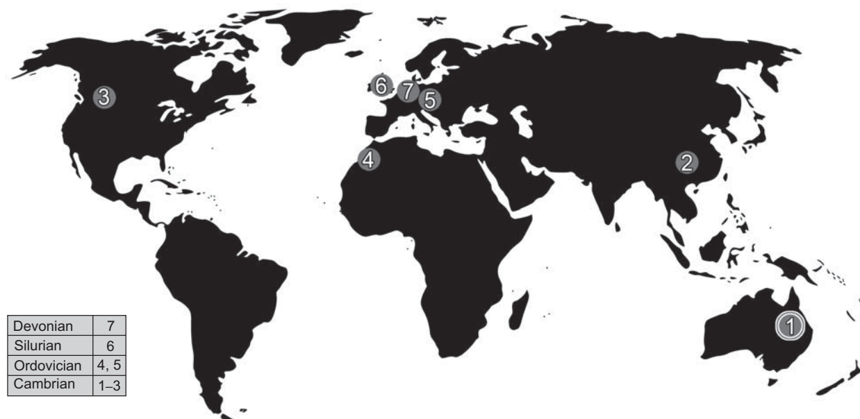
Fig. 4. Localities, in which Marrellomorpha (sensu Kühl et al. 2008) have been found. 1, Monastery Creek Phosphorite Formation, Late Templetonian–Early Floran, Australia: Austromarrella klausmuelleri gen. et sp. nov. 2, Kaili, early middle Cambrian, China: Marrella sp. (Zhao et al. 2003). 3, Burgess Shale, middle Cambrian, British Columbia, Canada: Marrella splendens Walcott, 1912 (Whittington 1971; García-Bellido and Collins 2006). 4, Fezouata biota, Ordovician, Morocco: Furca spp. (Van Roy 2006a, b; Van Roy et al. 2010). 5, Letná Formation, Ordovician, Czech Republic: Furca bohémica Fritsch, 1908 (Chlupáč 1999; Van Roy 2006a, b; Rak 2009; Rak et al. 2013). 6, Herefordshire, Silurian, England: Xylorhis chledophilina Siveter, Fortey, Sutton, Briggs and Siveter, 2007 (Siveter et al. 2007). 7, Hunsrück slate, Lower Devonian, Germany: Vachonisia rogeri Lehmann, 1955 (Kühl et al. 2008); Mimetaster hexagonalis Gürich, 1931 (Kühl and Rust 2010). Table indicates occurrences.

is known from the “Orsten”, and this is significantly smaller than the many species described from Burgess Shale-type lagerstätten.