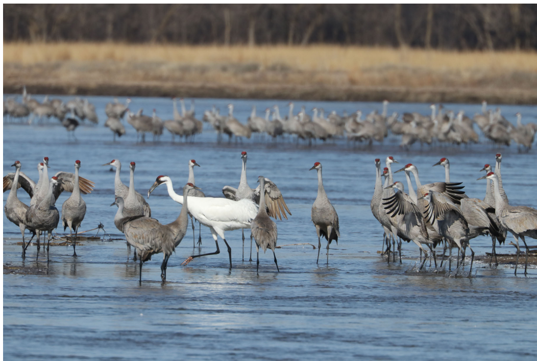
Fig. 1. Photo of an adult Whooping Crane ( Grus americana ), with a channel catfish ( Ictalurus punctatus ; estimated at just over one year old) in its bill, moving among Sandhill Cranes ( Antigone canadensis ) on 22 March 2018 at about 10:30 on the main channel of the Platte River, Hall County, Nebraska, USA.

add to the sparse information concerning Whooping Crane diet during migration by describing an observation novel to the scientific literature regarding an adult feeding on multiple juvenile channel catfish ( Ictalurus punctatus ) in the CPRV.