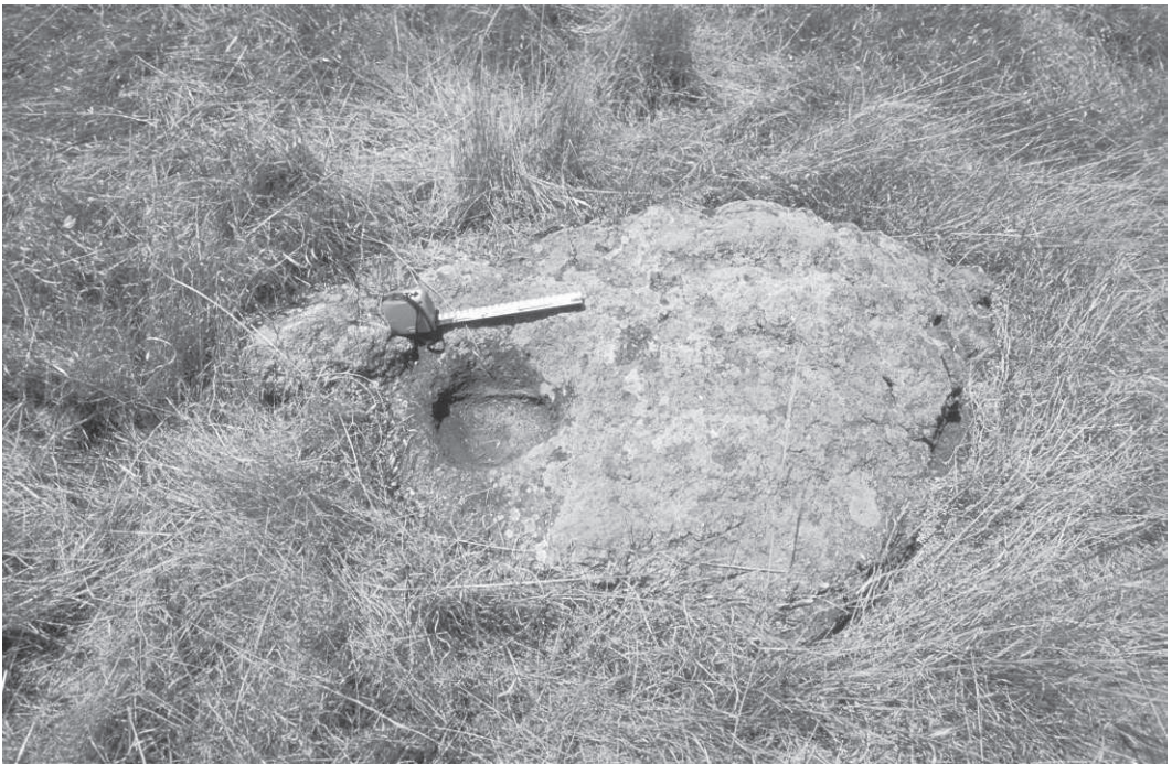
Fig. 4. Mortar hole within a bedrock outcrop at CA-SCRI-574.