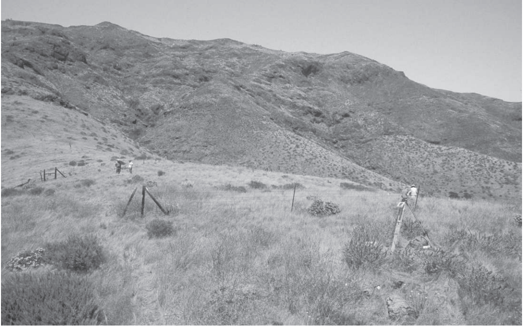
Fig. 3. CA-SCRI-574 looking northeast. The 2 fieldworkers standing in the far background are near the site's northern margin.