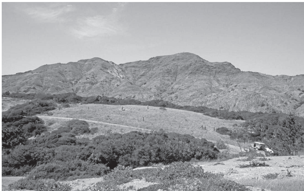
Fig. 2. CA-SCRI-555 looking north-northwest. The fieldworkers are standing on the grass-covered knoll where the site is located.