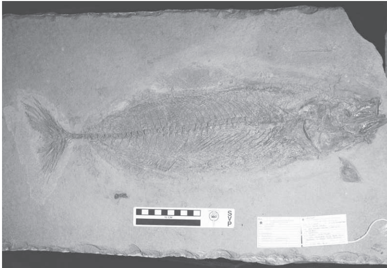
Fig. 8. Sardra stockii , a fish from the Modelo Formation of Santa Monica Mountains National Recreation Area (SAMO) (holotype LACM 1059).

from several localities in and around the eastern end of SAMO. A half-dozen species of fish were named from specimens probably recovered from land now within the recreation area's boundaries (David 1943). Another notable group of fossils from the recreation area and immediate vicinity is an assemblage of rare seaweeds (Parker and Dawson 1965). Egg cases of argonaut cephalopods have also been described (Saul and Stadum 2005). Other more typical fossils discovered in the formation within SAMO include several groups of marine microfossils, bivalves, gastropods, and echinoids and a few marine mammal bones (Hoots 1931). Good specimens of birds (Miller 1929, Howard 1958, 1962) and dolphins (Barnes 1985) have been found just outside of SAMO.