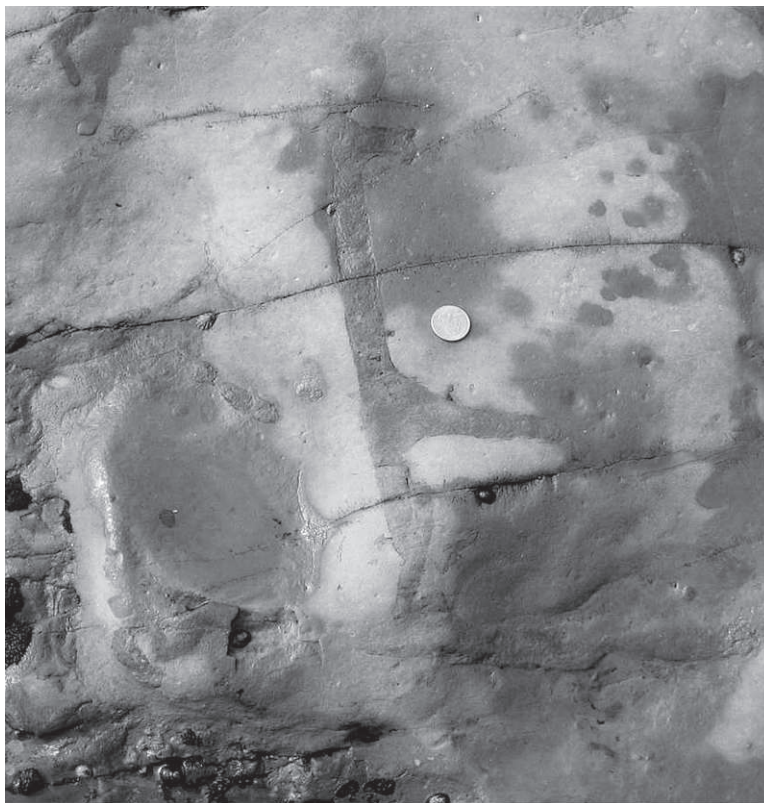
Fig. 3. Invertebrate burrows at Cabrillo National Monument (CABR).

fossiliferous within CABR, with several fossil localities yielding abundant bivalves and gastropods as well as sponges, corals, bryozoans, chitons, barnacles, crabs, and bony fish (Kern 1977, Tweet et al. 2012).