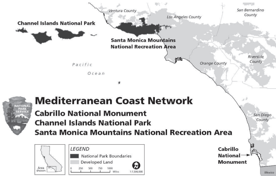
Fig. 1. Map of the Mediterranean Coast Network.

end, the 270 NPS units with significant natural resources have been divided into 32 networks based on their shared natural features and systems. Among these networks is the Mediterranean Coast Network (MEDN), which encompasses the southern third of the California coast (Fig. 1). Within the MEDN are 3 park units: Cabrillo National Monument (CABR), Channel Islands National Park (CHIS), and Santa Monica Mountains National Recreation Area (SAMO). Although none of these units were created with fossil resources in mind, each of them includes abundant fossils. In fact, CHIS and SAMO have some of the most extensive fossil records of any NPS unit.