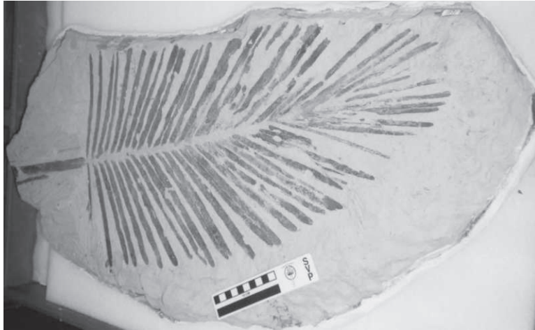
Fig. 2. A cycad leaf from Cabrillo National Monument (CABR) (SDMNH 48361).