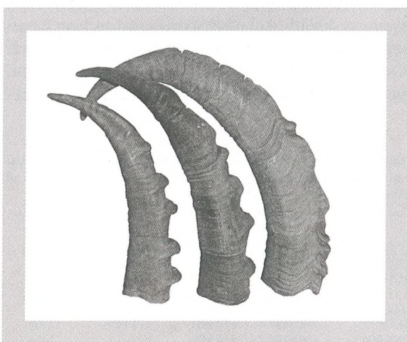
Figure 2. Right horns of three males in their fourth year of life from Bregaglia (Grisons, Switzerland). From left to right: a pure Alpine ibex ( Capra i. ibex ), an F2 and an F1 hybrid Alpine ibex x domestic goat hybrid, respectively.