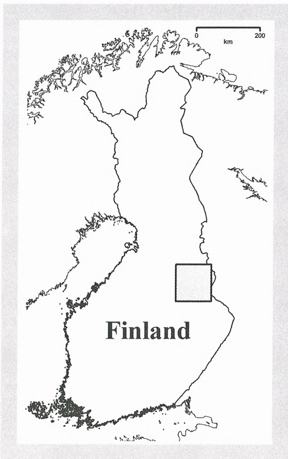
Figure 1. Location of the study area in east-central Finland where six wolf territories were examined during 1999-2001.

We performed our study in east-central Finland (Fig. 1) during 1999-2001. The study area is mostly comprised of exploited coniferous forests dominated by Scots