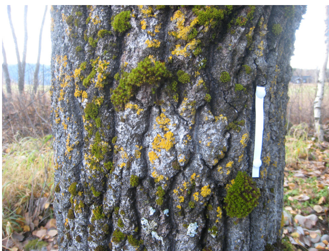
Figure 1. A Physcietalia vegetation with a large cover of Orthotrichetalia moss species, or an Orthotrichetalia vegetation invaded by Physcietalia lichen species? We prefer an integrated approach with both bryophytes and lichens included: several moss species ( Lewinskya speciosa , Nyholmia obtusifolia (both species formerly in the genus Orthotrichum , hence the name Orthotrichetalia ; Goffinet et al. 2004, Sawicki et al. 2010, Lara et al. 2016), Pylaisia polyantha ) and many lichen species ( Athallia pyracea , Caloplaca cerina , Candelariella xanthostigma , Myriolecis dispersa , Phaeophyscia orbicularis , Physcia adscendens , P. aipolia , P. stellaris , Toniniopsis subincompta , Xanthoria parietina ) were identified in an Orthotricho-Physcietea vegetation on a Populus tremula trunk (Koppang, Norway 2020). The length of the scale bar (white piece of paper) is 10.0 cm.

Many bryophyte and lichen species share the same habitat and substrate and are subject to the same (a)biotic conditions. Therefore, whenever possible, we integrated bryophyte and lichen syntaxonomy. As a result, our choice of syntaxa and syntaxon names fits the Dutch situation well but is not always in accordance with the International Code of Phytosociological Nomenclature (ICPN) (Weber et al. 2000). To illustrate this, we combined the 'bryophyte class' Frullanio dilatatae-Leucodontetea sciuroidis Mohan 1978 and the 'lichen class' Physcietea Tomaselli and De Micheli 1952 into one integrated class divided into the bryophyte-dominated order Orthotrichetalia Hadač in Klika and Hadač 1944 (originating from the Frullanio-Leucodontetea ) and the lichen-dominated order Physcietalia Hadač in Klika and Hadač 1944 (originating from the Physcietea ). According to the ICPN, the new name should be: Physcietea Tomaselli and De Micheli 1952. As in our integrated class both bryophyte and lichen species play a more or less equally important role, we combined both the original class names into the new name Orthotricho-Physcietea Tomaselli and De Micheli 1952 (Fig. 1), although not valid according to the ICPN. Why we chose to follow the ICPN in specific cases, and why we chose to divert from it in many other cases, is extensively