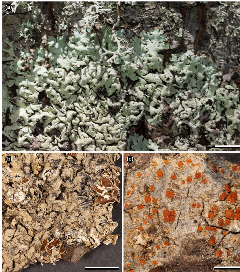
Figure 2. Blastenia monticola and Hypogymnia laminisorediata , general habit. A: H. laminisorediata on P. heldreichii in site Yavorov Chalet. B: H. laminisorediata SOMF 24313, locality 14-12, on P. peuce . C: B. monticola SOMF 31122, locality 14-3, on P. heldreichii . Scale bars: A and B = 1 cm, C = 2 mm.

However, a specimen of L. cadubriae collected by A. Vězda (14-15) was found, and the species was also collected during the fieldwork at the site Treshtenik Chalet (15-4).