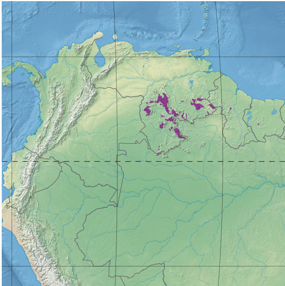
Figure 1. The Pantepui ecoregion of Venezuela. < https://commons.wikimedia.org/w/index.php?curid=104644538 >.

are illustrated as median pores (sometimes named luminal pores), or they lie rather tightly adjacent to the chlorophyll cells as commissural pores in \pm continuous rows. 2) Imperfect pores are unringed and only with a membrane thinning, but without perforation. Such imperfect pores look paler when stained leaves are examined in microscope. 3) Pseudopores are without perforations, closely facing the chlorophyll cells, and are delimited by semi-circular, semi-elliptic to elongate-rectangular fibril bands connected to the inner walls, and sometimes have thin membranes. Pseudopores are usually confined to the concave leaf surface.