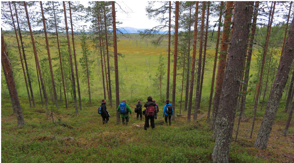
Figure 4. Tuulijoki mires, Kittilä.

Tuulijoki is a mostly oligo-mesotrophic mire area that is in the process of being established as a nature conservation area (Fig. 4). A northwest-southeast ridge runs across the mire, and locals use it as a recreational area. We started from the southern part of the mire (Lehmäkaltionvuoma mire; lehmä = cow, kaltio = spring, vuoma = mire), which was mostly oligotrophic with several abundantly flowing mesotrophic springs. For people of the south, the combination of Sphagna there seemed unusual, for instance, Sphagnum majus var. norvegicum , S. annulatum , S. balticum , S. angustifolium and S. fuscum were growing intermixed.