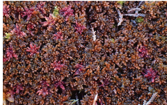
Figure 4. Wet Sphagnum beothuk growing at lower ground at Toröds mossen. Note the dark brown colour and the somewhat 5-ranked branch leaves.