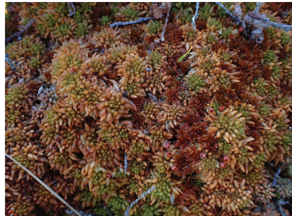
Figure 5. Sphagnum beothuk often grows in hummocks together with S. austinii as it did at the Swedish site, Toröds mossen. (Photo: N. Lönnell).