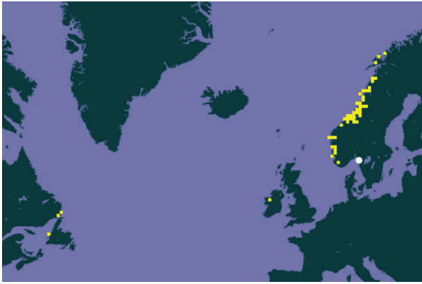
Figure 1. Distribution map of Sphagnum beothuk (yellow squares) from GBIF (GBIF Secretariat: GBIF Backbone Taxonomy. doi:10.15468/39omei, accessed via <www.gbif.org/species/7846758> on 2017-03-30) with the new record in Sweden marked (white circle). The species certainly occurs more abundantly in Britain and Ireland than shown on the map, but the exact frequency and distribution of S. beothuk in relation to S. fuscum in this area is under revision.