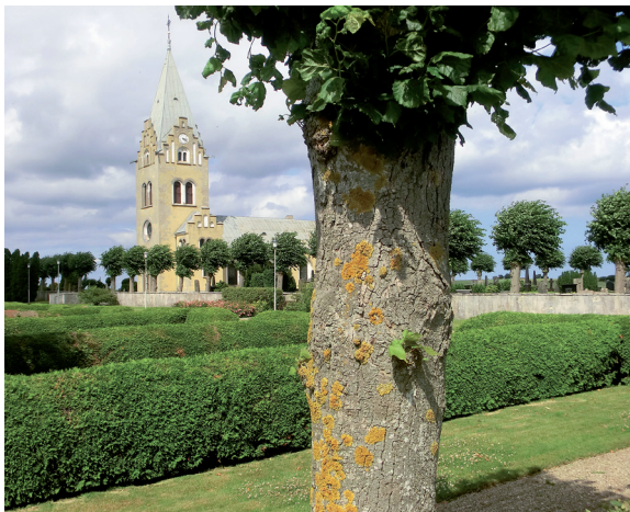
Figure 2. Epiphytic population consisting of one single thallus of X. calcicola on a Tilia sp. (Östra Nöbbelöv church).

The populations found on bark vary in size from 1 to ca 200 thalli (Fig. 2–5). All bark populations are small (1–24 thalli), except one (Skegrie churchyard, Fig. 5). Two are rediscoveries at localities where it has previously been collected on bark and 12 are new discoveries. In total,