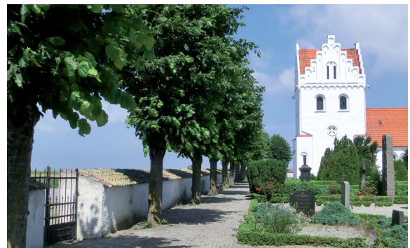
Figure 5. The largest bark population found, with approximately 200 thalli growing on bark of 22 Tilia sp. trees. The surrounding wall population is also very large (Table 1) (Skegrie church).

Our results support the hypothesis that establishment on trees are dependent of wall populations in close vicinity, continuously bombarding the suboptimal tree habitats with diaspores. The Mölleberga churchyard locality, where the churchyard wall has recently been whitewashed and the wall population are now without X. calcicola