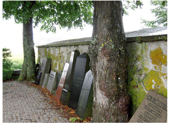
Figure 3. Two trees ( Tilia sp.) with X. calcicola growing close to the churchyard wall with a large X. calcicola population (Hofterup church).

we have observed ca 300 thalli of X. calcicola growing on bark. At six of the previously known localities, including one where it was reported relatively recently (Malmqvist 2000), the species was not found (Table 1). At all localities except one X. calcicola in addition to bark was present on the surrounding churchyard walls. The only exception was Mölleberga churchyard (Fig. 4B), where there were virtually no lichens on the wall, indicating that it had been recently whitewashed (Lindblom and Blom 2010). The wall populations at localities where X. calcicola grows on bark were, on average, larger than other wall populations ( 1706 \pm 2559 versus 489 \pm 1360 thalli), and a larger proportion of them possessed thalli with apothecia (71.4% versus 50.5%). Thus, localities with tree populations seem to have important source populations on walls in relation to localities with populations on walls only. Seemingly suitable churchyard trees were present at most of the investigated localities, indicating that colonization of X. calcicola on trees is a rare event. The trees harbouring X. calcicola were always growing close to the wall habitat, up to \leq 5 m (Fig. 3). These results add to the hypothesis that trees are actually suboptimal habitats for X. calcicola . Hence, bark populations are sinks (sensu Dias 1996) sustained by continuous supply of diaspores from the connected source population on walls (sensu Dias 1996).