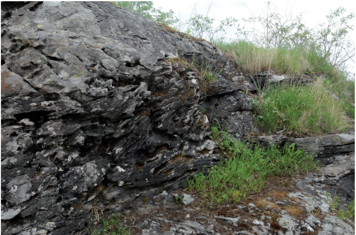
Figure 3. Porella obtusata is typically growing in small patches on sunlit base rich rocks close to the sea, like here at Bømlo, Hordaland. (Photo: K. Hassel).

Porella obtusata is usually found growing in thick patches or small carpets on sunlit calcareous rocks or other base-rich rocks close to the sea (Fig. 3). The substrates of P. obtusata along the Norwegian coast are different base-rich bedrocks like greenstone, marble and limestone. In Bømlo the species seems to have preference for greenstone and is not very frequent in the areas with limestone and marble. The Kvitsøy area is also rich in greenstone. The tendency of the rock to create fissures and small cavities may be of higher significance to the species than the kind of rock itself. Exposure varies between east/southeast and northwest, but most localities are southerly to westerly exposed. All new sites are below 20 m a.s.l., and most records are below 6–7 m a.s.l. At Alden island in Askvoll, Jørgensen (1934) cites B. Kaalaas 1889 on P. obtusata growing “up to 300 m”. This is very different from all other known Norwegian localities and should be confirmed. In Kvitsøy and Bømlo P. obtusata often grows in small fissures with trickling water, or protected against the wind and sun in small cavities made by erosion of the rocks. Sometimes it is found