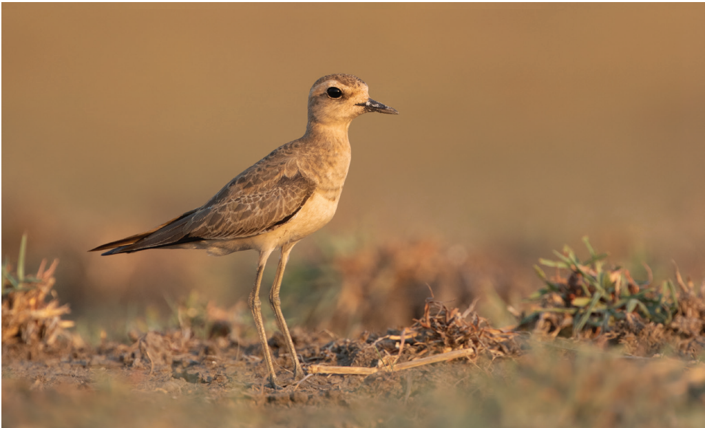
Figure 3. Caspian Plover Charadrius asiaticus , Gorongosa National Park, Mozambique, 23 October 2016; the first documented country record

2013; Brooks & Ryan 2024). A flock of 36 at Gorongosa National Park on 17 October 2016 (Z. Pohlen & C. Gesmundo in litt. 2016; S33982187; Fig. 3) was the first record supported by a photograph and was followed by a series of observations, mostly of 1–2 birds, until 16 November 2016. Finally, one at Macaneta on 4–25 February 2024 (JH & S. Jones, S160628994, T. & A. M. Moore, S161197293, JH, S162839291).