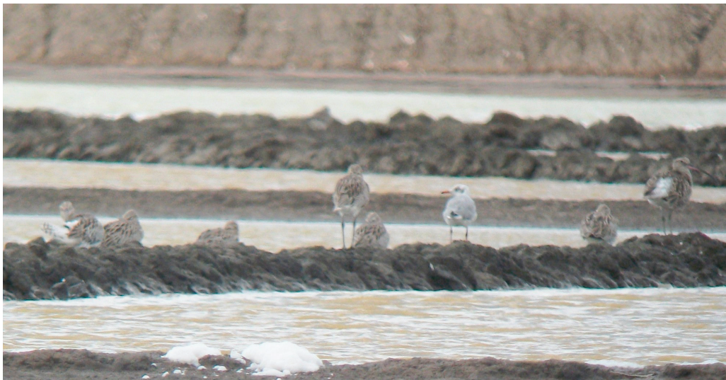
Figure 8. Seven Eurasian Curlews Numenius arquata , Salinas Zacharia, Mozambique, 12 January 2012, including at least two birds with strong supercilia and crown-stripes, and the bird on left also has white uppertail-coverts, features thought to be characteristic of N. a. suschkini (Gary Allport)

Birds from the eastern and western subspecies are visually distinct morphologically. Nominate arquata and suschkini are smaller than orientalis with less sexual dimorphism in size; arquata usually has barred axillaries and a dark-streaked lower rump and uppertail-coverts, whereas suschkini has white axillaries and a paler uppertail (Engelmoer & Roselaar