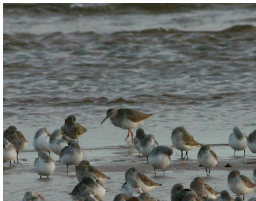
Figure 7. Common Redshank Tringa totanus , Ponta da Barra, Inhambane, Mozambique, 19 April 2008; the first documented country record

Subsequently, recorded as follows: singles at Ilha do Bazaruto on 4 November 1997 (K. Groenendijk, S1766796), Maputo on 12 March 2006 (R. Grey in Hockey et al. 2005 and Bull. Afr. Bird Cl. 14: 101), Barra on 19 April 2008 (M. Booyesen in litt. 2021; the first to be documented, see Fig. 7), Panda/Chacane Wetlands on 5 November 2009 (M. Booyesen in litt. 2021, T. Hardaker in Bull. Afr. Bird Cl. 17: 121) and San Sebastian