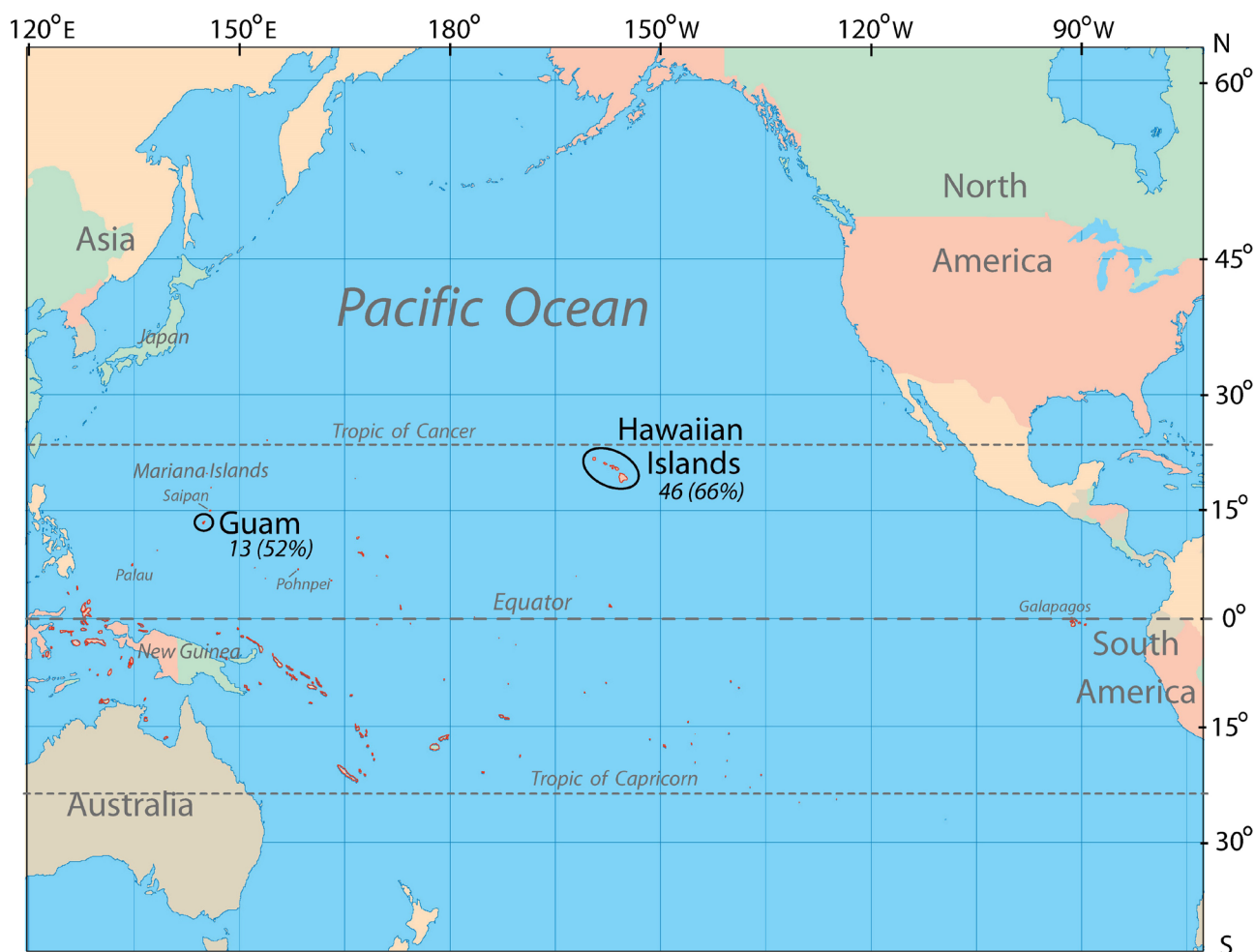
Fig. 1. Map of the Pacific Ocean showing the locations of the Hawaiian Islands and Guam. The number of established non-native fish species is included (in parentheses is the number of established species as a percent of all known non-native fishes introduced to inland fresh waters of each of the two study sites). Many of the larger small tropical islands are shown in red, but thousands of other Pacific islands are too small to display.

success of non-native freshwater fish species introduced to Hawaii and Guam. Both are oceanic islands or island groups located in the tropics. Applying a frequentist approach, our analysis focus was on the initial stage of the invasion process with establishment as the outcome. To aid our investigation, we also examined data on fish introductions and establishment for other tropical islands in the Pacific and at a global scale. Our research found records documenting as many as 46 non-native, freshwater fish species to be established in inland and estuarine waters of Hawaii; in contrast, only about 13 species are known to be established on Guam (Brock 1960, Maciolek 1984, Eldredge 1994, Fuller et al. 1999, Yamamoto & Tagawa 2000, Mundy 2005). Inclusion of Hawaii, rather than Guam alone (our original intent), provided necessary and sufficient data for improving the power of our modelling approach and ultimately allowed development of a quantitative model useful for analytical purposes.