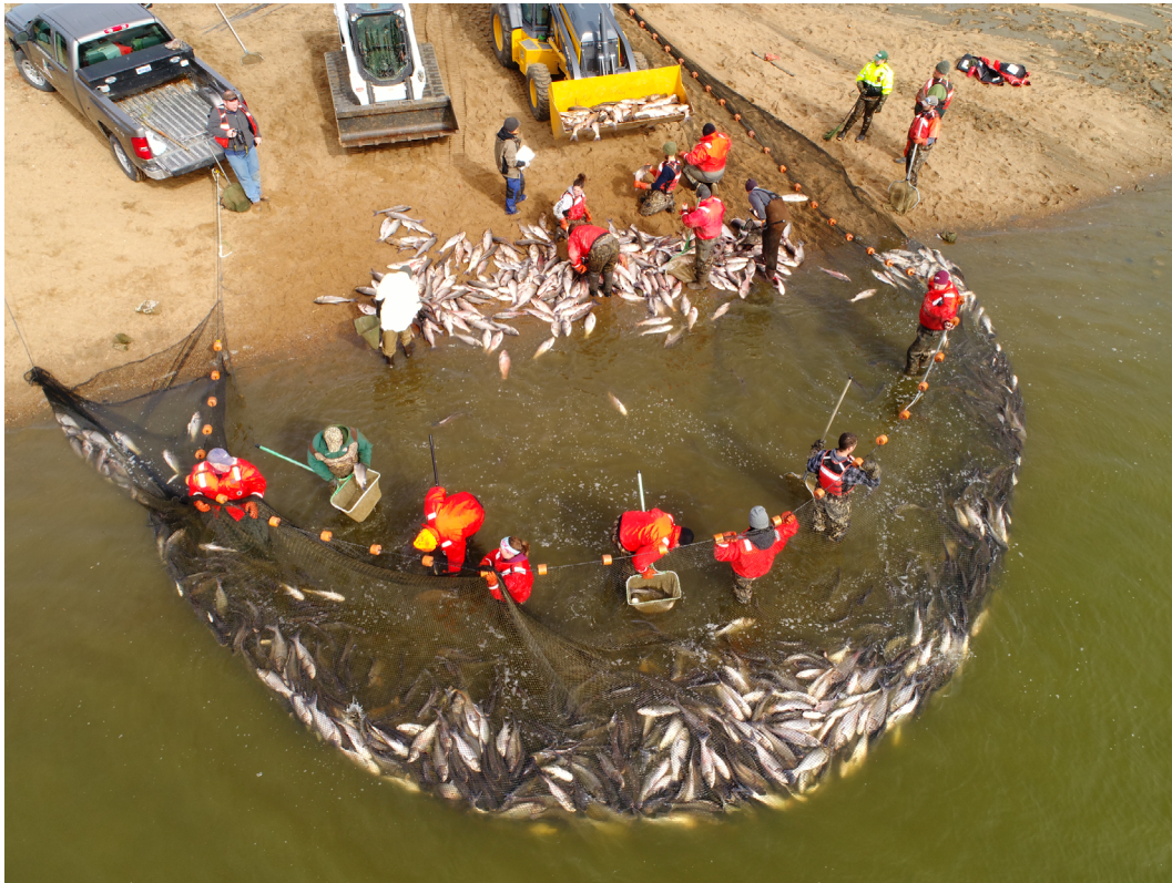
Fig. 5. Mass removal from a modified unified method (MUM) event in Creve Coeur Lake near St. Louis, Missouri. Silver carp were driven into a final collection area and contained within a large seine for sorting and removal. Approximately 108,000 kg of silver carp were removed from the lake during this multi-day process (photo Kevin Muenks – Missouri Department of Conservation, used with permission).

a location where abundances were extremely low. This application in Pool 8 was useful for monitoring purposes and may result in early detection or rapid response actions in those areas. Continued research would be beneficial to refine MUM methods and techniques, but resource managers could consider current MUM techniques as an available tool to support population control efforts.