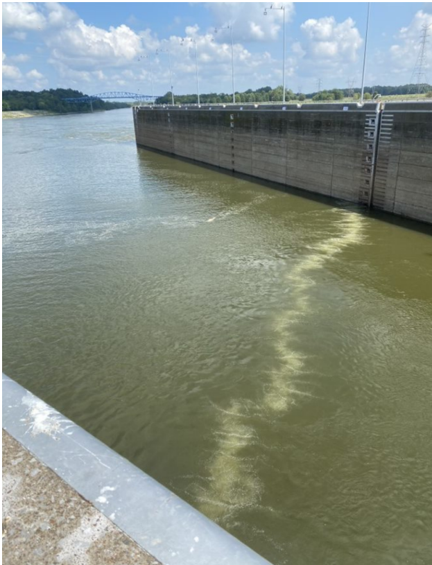
Fig. 3. An experimental BioAcoustic fish fence (BAFF) in operation at the downstream approach channel of Barkley lock on the River Cumberland near Grand Rivers, Kentucky. Photograph shows the air-bubble curtain when the system is turned on. The BAFF is planned to be operated for up to three years for a research study to evaluate its effectiveness to reduce upstream passage of invasive carps.

because populations downstream are greater than populations upstream and fish must use the lock to move upstream past the dam (Post van der Burg et al. 2021). This location is important for resource managers to cut off the source of invasive carps in the Ohio River Basin from migrating into the Tennessee River Basin. The primary objective of the field test at Barkley lock and Dam is to evaluate the effectiveness of a BAFF at preventing telemetered silver carp from moving upstream past the BAFF and into the lock chamber under the wide range of environmental conditions that occur at the site. Three native fish species (paddlefish Polyodon spathula Walbaum; smallmouth buffalo Ictiobus bubalus Rafinesque; freshwater drum Aplodinotus grunniens Rafinesque) are also telemetered as part of the BAFF evaluation to determine potential effects to native fishes.