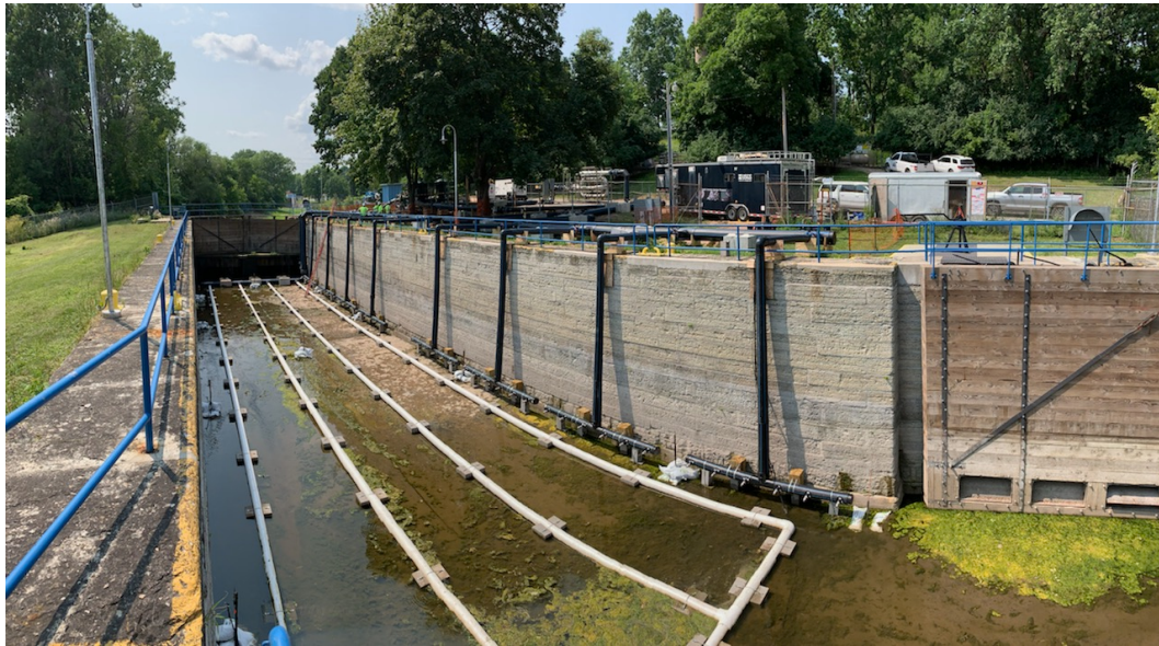
Fig. 4. Installation of an experimental carbon dioxide (CO 2 ) deterrent system at lock #2 on the River Fox near Kaukauna, Wisconsin. Photograph shows gas distribution piping on bottom and side of lock chamber. This system was temporarily installed for research purposes in 2019 to evaluate gas system engineering and performance within navigation lock chambers.

currently exist (Fig. 4; Zolper et al. 2019). One common method uses differential pressures to infuse CO 2 into water. Water from the lock is pumped into a pressurized mixing chamber while CO 2 at a slightly higher pressure is simultaneously injected into the mixing chamber to achieve supersaturated concentrations (e.g. 1,000-2,000 mg/L) prior to being distributed back to the lock. This recirculating process continues until complete mixing and target CO 2 concentrations in the lock are achieved. A second method involves direct gas injection within the application site. Carbon dioxide gas is applied directly into water via aeration using microbubble porous diffusers. Liquid CO 2 storage systems coupled with gas vaporization make either application system viable for large-scale application. Both CO 2 injection methods are used worldwide for wastewater and effluent water treatment processes and have been adapted to control invasive carps (Zolper et al. 2019).