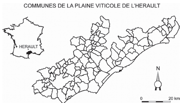
Fig. 1. Map of the study area with communes (INSEE).

important types of agriculture are grasslands (7 %), cereals (6 %) and fruit orchards (3 %). Natural or semi-natural vegetation is dominated by Mediterranean evergreen shrub lands (6 % of the region's surface) and forests (5 %). Urban land occupies about 8 % and wetlands about 10 % of the region.