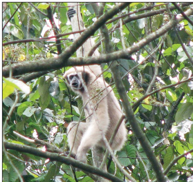
Figure 2. Adult female eastern hoolock gibbon, Hoolock leuconedys .