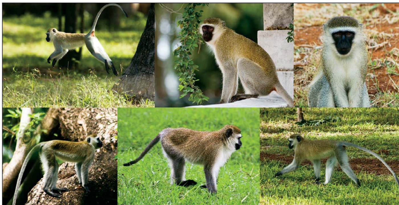
Figure 4. Chlorocebus pygerythrus ' hilgerti ' adult males over the geographic range in Kenya and Tanzania surveyed during this study. Top row , left to right: Malindi, northern coast of Kenya; Majengo, north of Mombasa, southern coast of Kenya; Tanga, northern coast of Tanzania. Bottom row , left to right: South Horr, north-central Kenya; Lake Naivasha, south-central Kenya; Lake Manyara, north-central Tanzania.

We are grateful to Primate Conservation Inc., the Margot Marsh Biodiversity Foundation, the Primate Action Fund, and the Critical Ecosystem Partnership Fund at Conservation International for financial support. We acknowledge the Kenya Ministry of Education, Science & Technology (permit 13/001/33C 283) and the Tanzania Commission for Science