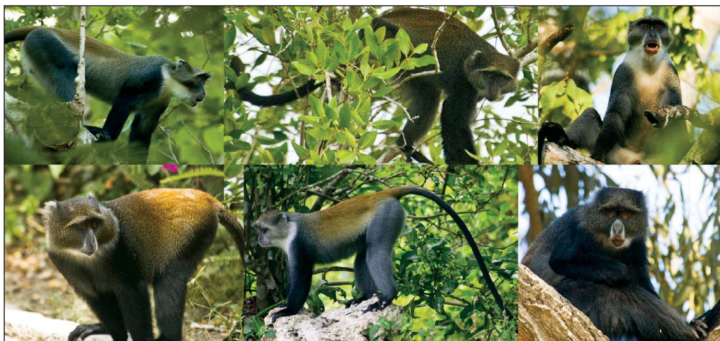
Figure 3. Cercopithecus mitis ‘ albogularis ’ adult/subadult males over the geographic range in Kenya and Tanzania surveyed during this study. Top row , left to right: Gedi Ruins, central coast of Kenya; Saadani National Park, northern coast of Tanzania; Mrima Hill, southern coast of Kenya. Bottom row , left to right: Usa River, northeastern Tanzania; Unguja Island, eastern Tanzania; Ndarakwai, northeastern Tanzania.

Some geographic variation among adult and subadult male C. p. ‘hilgerti’ is, however, present, particularly in (1) the intensity of pelage color, (2) the length of the whiskers,