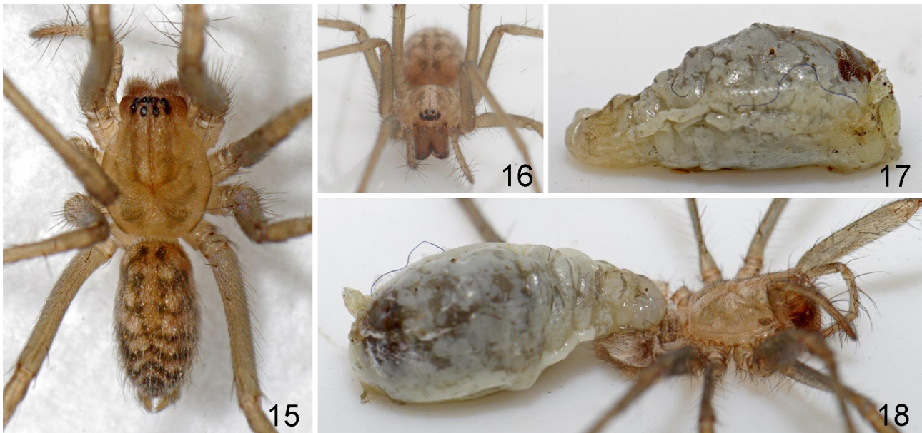
Figs. 15–18. Larva of Cyrtus sp. reared from female Eratigena sp. from Spain. The fly did not reach adulthood. 15. Eratigena sp. in dorsal view. 16. Eratigena sp. in frontal view. 17. Cyrtus sp. larva in lateral view. 18. Cyrtus sp. larva emerging from Eratigena sp. in lateral view.