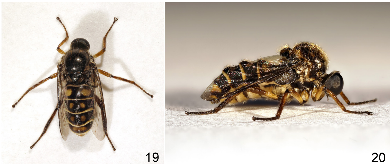
Figs. 19–20. Male Ogcodes guttatus Costa, 1854 reared from Pseudicius sp. from Rhodes (Greece). 19. Dorsal view. 20. Lateral view.

Note: at the time of collecting, the sluggish adult fly, which appeared to have eclosed from its pupa recently, was sitting on the spider remains.