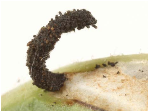
FIG. 1. Frass tube projecting from the underside of a mine of Rhopobota dietziana in a winterberry leaf.