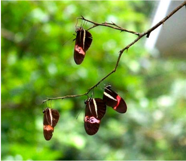
FIG. 1: Two mating H. erato butterflies at a communal roost. The male (labeled 5B upside-down) is on the left and the female is unmarked.

exact same perch to rest on each evening. There was no difference between perch choice and sex ( \chi^2 = 0.474 , d.f. = 1, p = 0.491 , n = 19 butterflies; Table 1), although older butterflies were more likely to roost on the exact same perch, compared to young butterflies ( \chi^2 = 4.263 , d.f. = 1, p = 0.039 , n = 19 butterflies; Table 1).