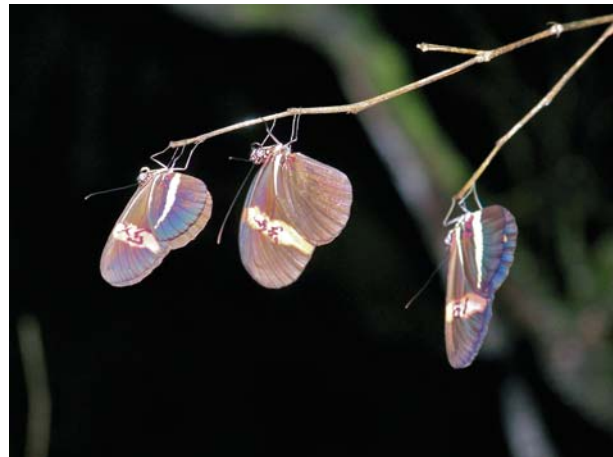
FIG. 2: A H. erato hydara – H. erato petiverana hybrid roosting between two H. erato petiverana butterflies. The hybrid lacks the large yellow hindwing band.

My observation that dragonflies roost with H. erato butterflies is probably not a result of limited roost substrate, since many dry branches were available in these sites to support other aggregations or single roosting perches. Both dragonflies and damselflies have been documented to form communal roosts (Parr & Parr 1974, Miller 1989, Rehfeldt 1993, Switzer & Grether 2000). It could be possible that other insects in