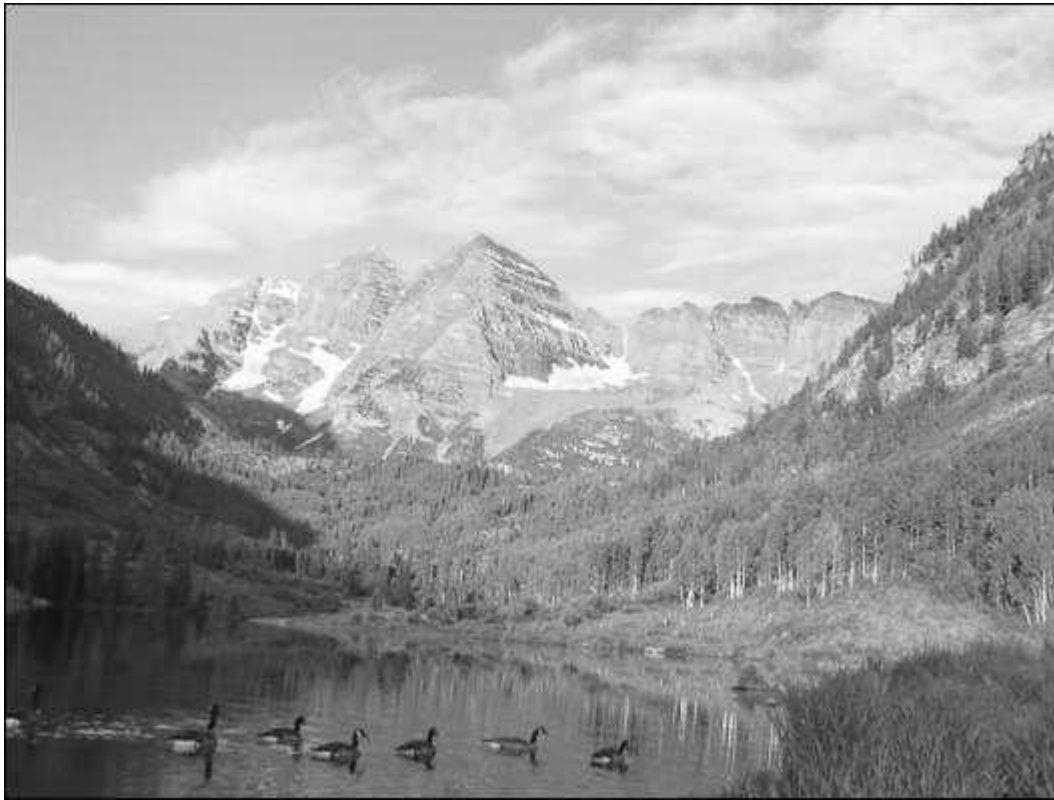
FIGURE 1 The Maroon Bells in the Elk Range near Aspen, CO, are a signature for the pristine alpine beauty of Colorado's Fourteeners. (Photo by Jon Kedrowski, August 2006)

study was performed by members of the Rocky Mountain Field Institute (RMFI) in the Sangre de Cristo Range of southern Colorado addressing the restoration efforts on Humboldt Peak (Hesse 2000). The information presented in the case of Humboldt Peak provided a good overall physical description of what is occurring on all of the Fourteeners. However, the study failed to directly address values indicating climber-visits to Humboldt Peak.