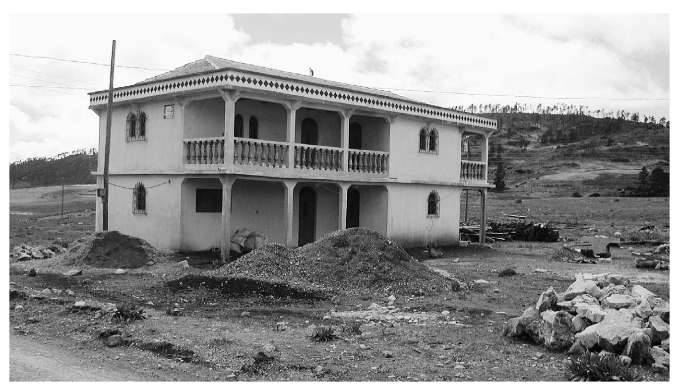
FIGURE 5 New, two-storey house built with remittance money from the USA.

produce the same products that their forefathers did—potatoes and sheep as the dominant products. All our informants were still involved in potato production, and 21 were involved in sheep ranching (at various scales). The harsh environment of the high plateau in the Cuchumatanes simply cannot support other forms of agriculture.