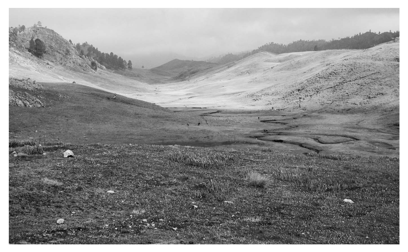
FIGURE 3 Former glaciated valley on the Altos de Chiantla plateau.