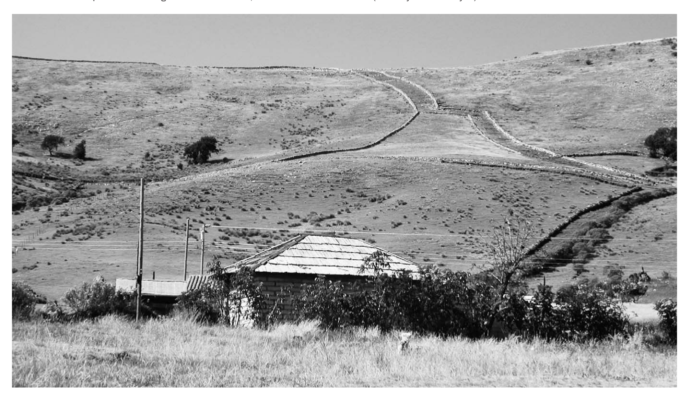
FIGURE 6 Landscape scene showing extensive rock walls, first built in the colonial era.

gone now. Not like when I was a boy. This is very hard on the old people who are poor." Another stated, "(development) agencies come and go, they waste money and time, why don't they help people with the trees, with (lack of) firewood?" When asked to rank how important the forest (or lack thereof) issue is, 22 of 24 informants claimed that the scarcity of wood and other forest products was "very important" or "severe."