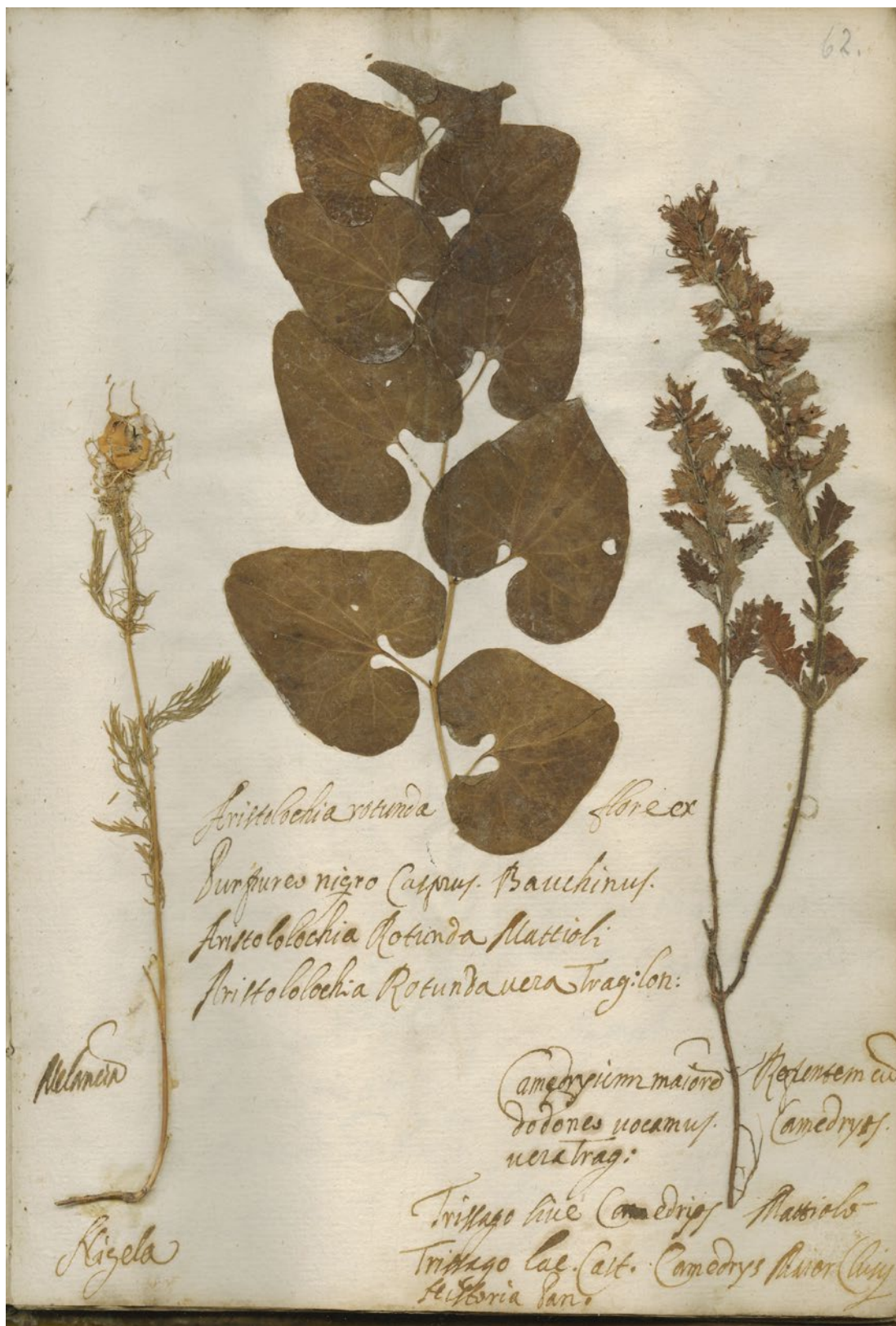
Fig. 2. – Herbarium sheet with a specimen of Teucrium chamaedrys L. (lower right) and the inscription: “ Camedryum maiorem Repentem cum dodoneo vocamus / Camedrys vera Tragi / Trixago sive camedryos Mattiolo / Trixago Lac. Cast. / Camedrus Maior Clusii Historia Plan. ”.