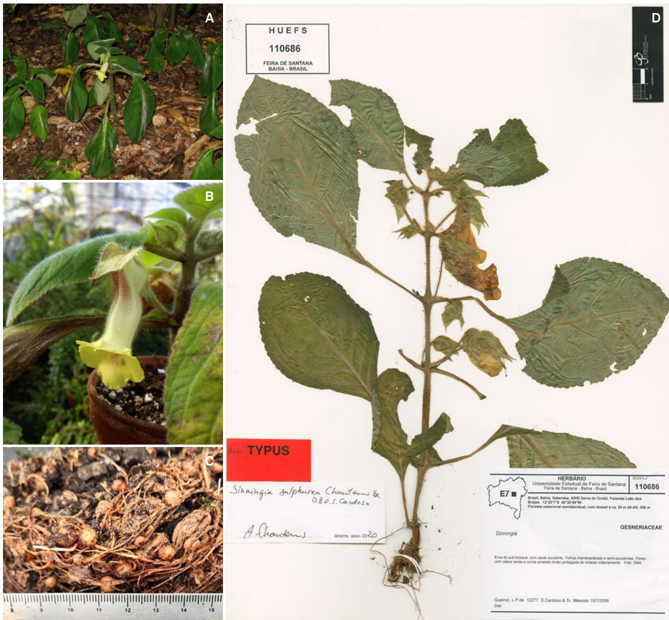
Fig. 4. – Sinningia sulphurea Chautems & D.B.O.S. Cardoso. A. Habit in the wild; B. Flower close-up; C. Underground storage system with numerous round tubers; D. Holotype at HUEFS. [A: Cardoso et al. 2066; B: cultivated in CJBG] [Photos: A: Domingos Cardoso; B: M. Perret; C: M. Peixoto] [D: © Universidade Estadual de Feira de Santana, scanned in G]