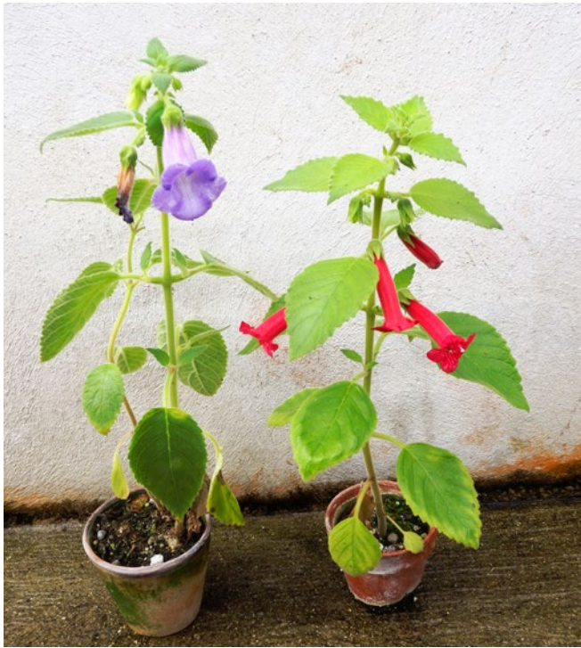
Fig. 3. – Image featuring the similar erect habit of Sinningia ganevii (left) and S. harleyi (right) and their distinct floral morphology corresponding to bee and hummingbird pollination syndrome, respectively.