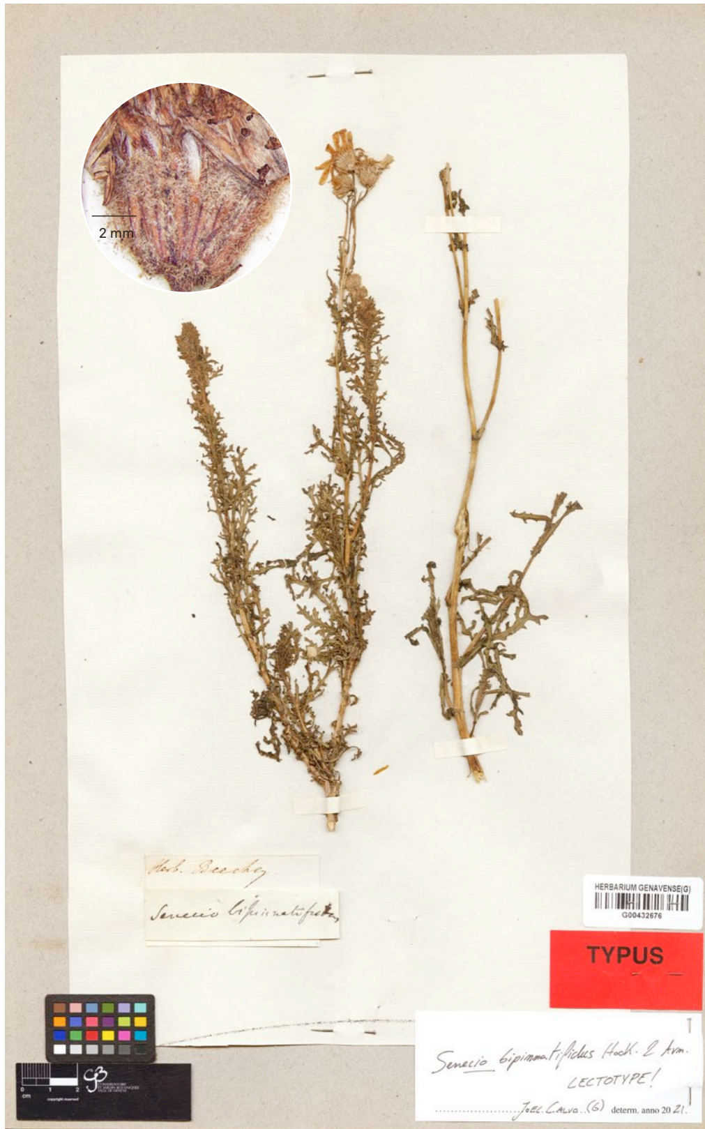
Fig. 1. – Lectotype of Senecio bipinnatifidus Hook. & Arn. [G00432676; Conservatoire et Jardin botaniques de Genève]