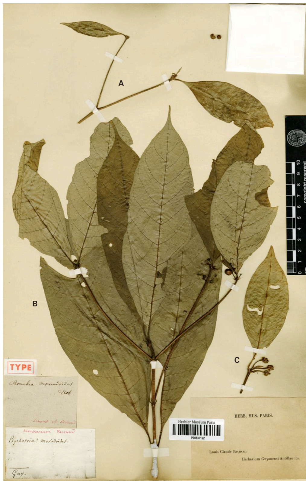
Fig. 1. – Type material of Ronabea morindoides A. Rich. A. Eumachia guianensis (Bremek.) Delprete & J.H. Kirkbr.; B–C. Lectotype of Ronabea morindoides A. Rich. ( \equiv Appunia morindoides (A. Rich.) Delprete, C.M. Taylor & T. McDowell). [P00837122]