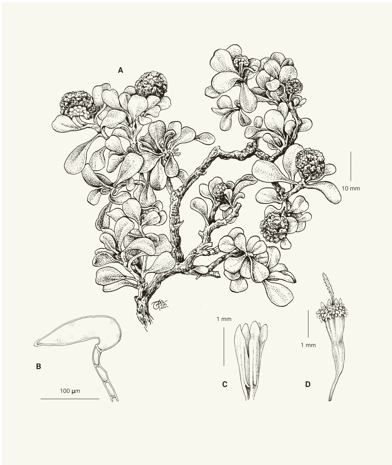
Fig. 1. – Pseudoblepharispermum tuddense Baldesi & Pignotti. A. Habit; B. Leaf surface hair, with comma-shaped distal cell; C. Anthers, with visible short tails at their base; D. Hermaphrodite, functionally male floret. [Merla, Azzaroli & Fois s.n., FT006212] [Drawing: L. Vivona]