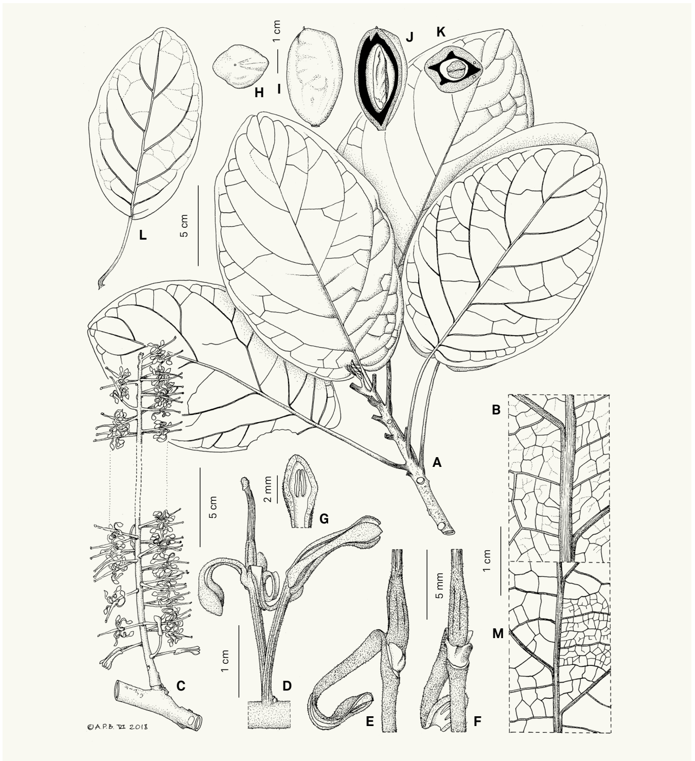
Fig. 1. – Kermadecia brinoniae H.C. Hopkins & Pillon (A–K) and K. elliptica Brongn. & Gris (L–M).

A. Vegetative shoot; B. Detail of leaf, abaxial surface, all veins raised except the finest branches, these shown as dotted lines; C. Inflorescence (total length 21.5 cm), showing flowers in pairs; D. Pair of flowers from C, each flower on a free pedicel (apex of axis to the left); E–F. Lateral and ventral view of opened flower with only one tepal remaining, to show the disc; G. Inner face of distal portion of tepal, showing a stamen; H–I. Apical and lateral views of mature fruit; J–K. L.S. and T.S. of mature fruit (black shading = very dense endocarp); L. Leaf, adaxial surface; M. Detail of L, abaxial surface, midrib and secondary veins raised, note numerous small areoles. [A–G: McPherson 1945, P; H–K: MacKee 16339, P; L–M: Vieillard 1106, K] [Drawing: Andrew Brown]