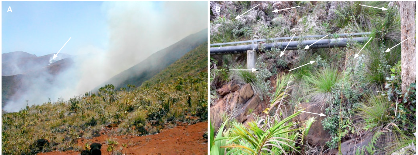
Fig. 1. – Pichonia munzingeri Gâteblé & Swenson. A. Overview of the Montagne des Sources fire on 29 December 2005, the arrow points to the fire in the Oumbéa creek; B. Upper population in degraded maquis vegetation showing Pteridium esculentum (G. Forst.) Cockayne flammable dead whitish fronds along the pipe to the water catchment, arrows point to ten individuals of Pichonia munzingeri .

Holotypus: NEW CALEDONIA. Prov. Sud: Mont-Dore, La Coulée, Captage de la Oumbéa, 21°11'19"S 166°34'22"E, 150 m, 14.III.2018, fl., Gâteblé & Rochard 1011 (P [P001156237]!; iso-: G [G00341841]!, MO!, MPU!, NOU [NOU089084]!, S [S18-39759]!).