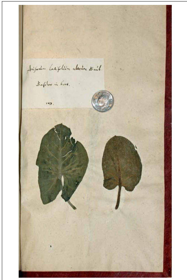
Fig. 2. – Original material of Arum arisarum L. [s.coll., UPS-BURSER]

Therefore, as the herbarium sheet in UPS-BURSER (Herb. Burser X: 143) is very incomplete, we select here as the lectotype the element of the protologue which best matches the traditional and current concept of Arum arisarum . Among the elements cited in the protologue, the illustrations by CLUSIUS (1601) and LOBELIUS (1581) clearly shows the characters of the leaves, spathe and spadix as indicated by LINNAEUS (1753), “ acaule, foliis cordato-oblongis, spatha bifida, spadice incurvo ”, and they are therefore suitable for typification of A. arisarum . These two illustrations are identical, therefore we designated here the Clusius’s illustration as the lectotype (Fig. 1).