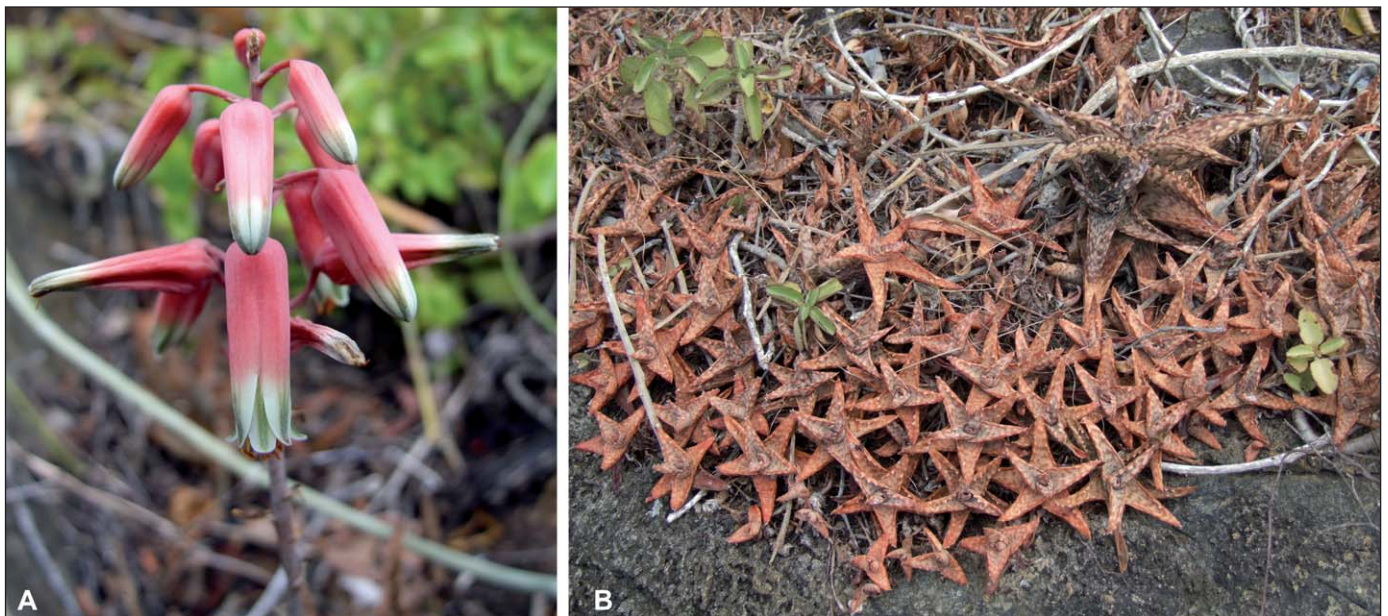
Fig. 3. – Living plant of Aloe fragilis Lavranos & Rössli at the type locality of Cap Manambato, near Iharaña (Voehemar). A. Inflorescence; B. Leaves.