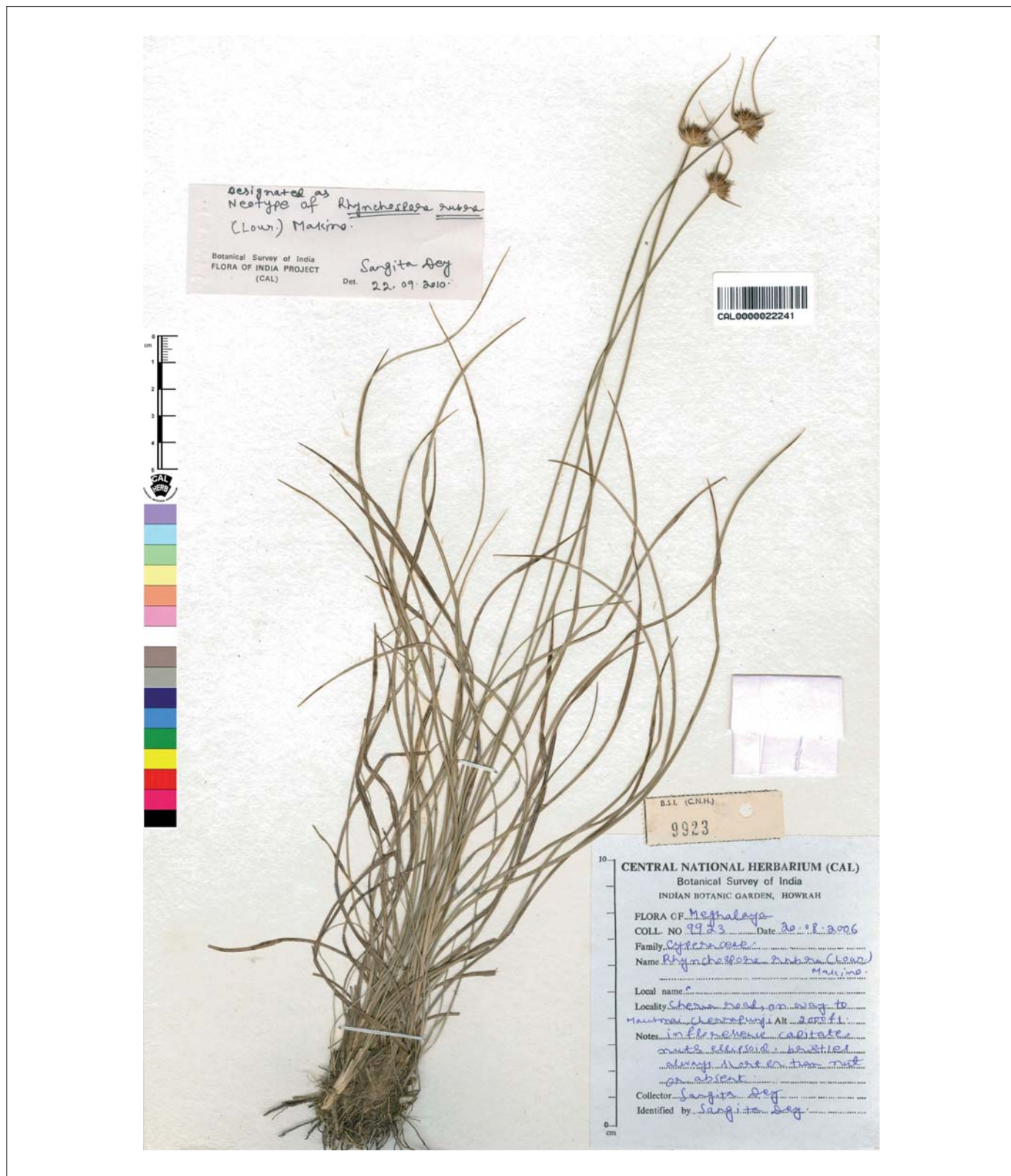
Fig. 3. – Neotypus of Rhynchospora rubra (Lour.) Makino.

[Sangita Dey 9923, CAL]