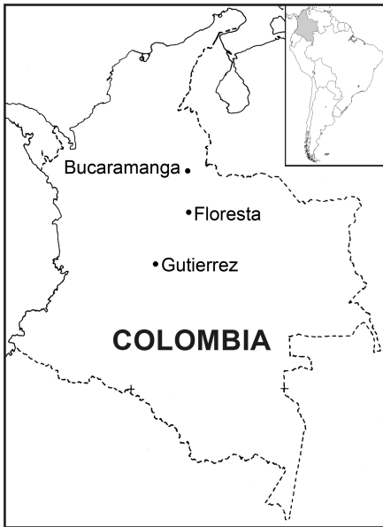
FIG. 1. Map of South America, showing Colombia and the cities of Gutierrez, Floresta, and Bucaramanga.

gested that there was limited faunal exchange between Colombia and the Malvinokaffric Realm, based on the occurrence of calmoniids in the Floresta Formation.