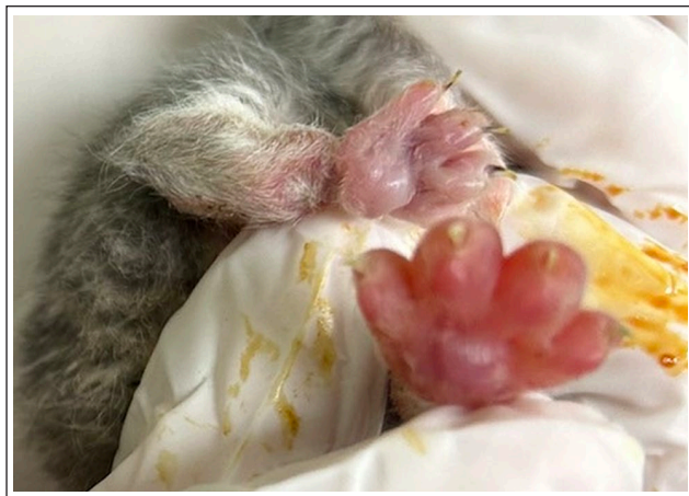
Figure 2 Circular soft tissue depression in the right metatarsus. Marked swelling of the left metatarsus

queen's inexperience, stress and additional factors, such as the owner's lack of experience, might exacerbate the condition.