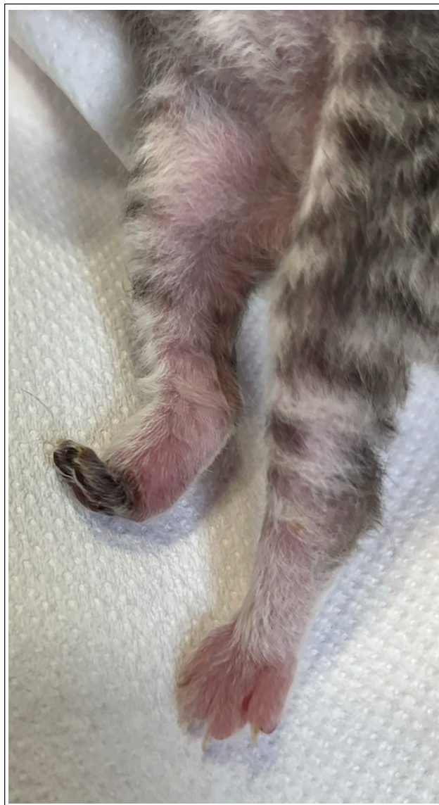
Figure 3 Dry gangrene 4 days after initial presentation

Umbilical cord entwinement in neonatal kittens, although rare, is clinically significant and can lead to complications. Timely observation can help resolve these complications. Through enhanced awareness, early detection and prompt intervention, veterinarians can mitigate the impacts of this condition. Further research and collaboration among