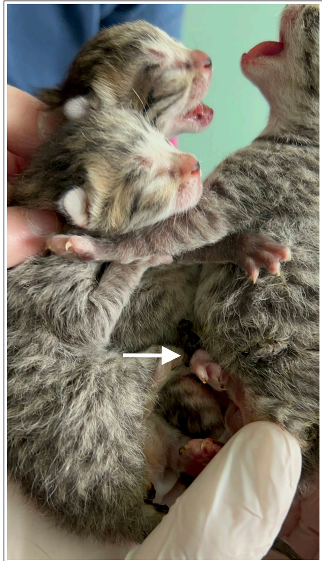
Figure 1 The cords of three kitten entwined with the metatarsus of one kitten (white arrow)

After resection of the umbilical entwinement, conservative treatment involved daily massages and the administration of an alternating hot/cold compress for 7 days. The conservative treatment approach was chosen due to the patient's age. The owner was advised to monitor the kitten's behaviour and appetite. Four days later, the kitten exhibited signs of necrosis of the right metatarsus and was presented with dry gangrene (Figure 3). Seven days after the initial examination, the gangrenous tissue detached, leaving unremarkable skin over the right tarsal joint. Sloughing due to bacterial infection was ruled out based on the patient's overall health status. At the last follow-up examination 6 months later, the kitten was leading an active and normal life.