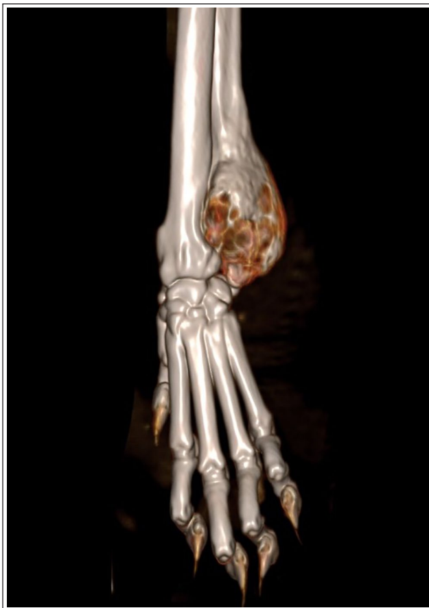
Figure 1 Three-dimensional CT reformatted image of the left distal antebrachium, carpus and manus of the cat at the time of diagnosis. There is an expansile bone lesion in the distal ulna with regions of cortical destruction

was cut with an oscillating saw (Colibri II; Synthes) approximately 4 cm from the ulnar styloid process and 1 cm proximal to the proximal gross limit of the mass (Figure 2).