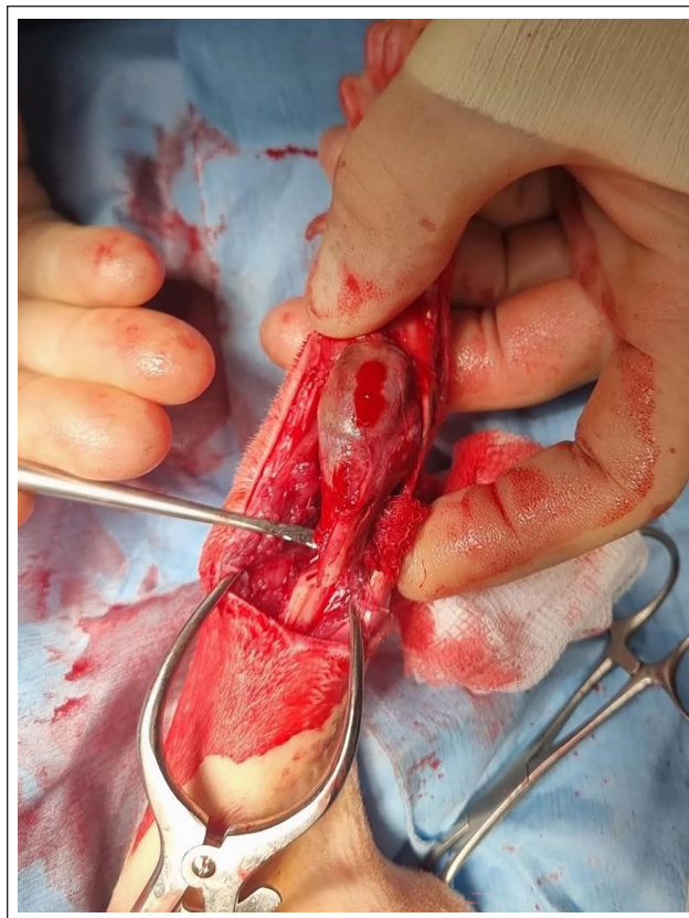
Figure 2 Intraoperative image of the lateral aspect of the left distal ulna. An ulnar osteotomy has been performed proximal to the cystic bone lesion

To allow for ulnar styloid process excision, the radio-ulnar ligament, short ulnar collateral ligament, palmar ulnocarpal ligament and accessorioulnocarpal ligament were transected. The left carpal joint was deemed stable on intraoperative assessment after the ulnectomy. The subcutaneous layer and dermis were closed with 3-0 monofilament polyglecaprone 25 suture (Monocryl; Ethicon). Orthogonal postoperative radiographs were obtained to assess for the level of the osteotomy and for complete excision of the lesion (Figure 3). A dressing was not applied. On recovery, pain was controlled with buprenorphine (0.02mg/kg PO q6h) and meloxicam (0.05mg/kg PO q24h). The cat started weightbearing on his left thoracic limb immediately after recovery from anaesthesia and was 2/5 lame 6 at the time of discharge 2 days postoperatively. The meloxicam therapy was