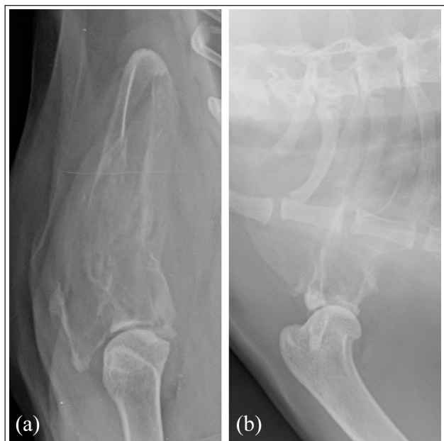
Figure 1 Radiographs of the right scapula in (a) anteroposterior and (b) laterolateral projection showing a mixed osteolytic and osteoproliferative lesion of the scapular neck and a discontinuity of the cranial contour line of the scapula

veterinarian and did not improve on pain medication (meloxicam 0.1 mg/kg PO q24h [Inflacam Suspension für Katzen; Virbac]) prescribed by the referring veterinarian.