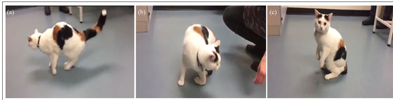
Figure 1 (a) Toe-walking on the left forelimb with hunched posture. (b) Weightbearing on the dorsal aspect of the left carpus. (c) Sitting back on the hindlimbs and non-weightbearing on the forelimbs

published reports of histopathologically confirmed myopathy as a result of T gondii in cats.