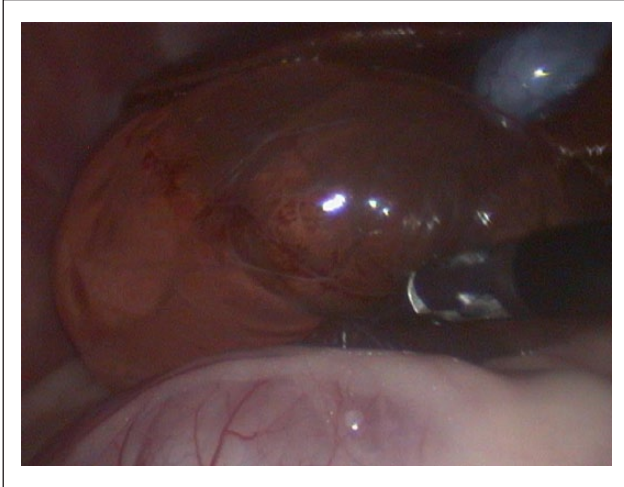
Figure 2 Laparoscopic visualisation of the hepatic cyst originated from the left medial hepatic lobe