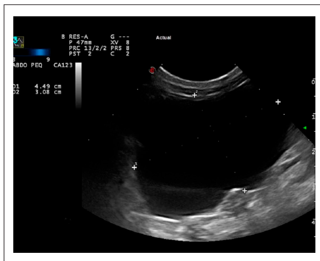
Figure 1 Ultrasonographic image of the hepatic cyst (4.5 cm × 3 cm)

Abdominal ultrasonography revealed that the hepatic cyst located in the left side of the liver had increased in size, measured 4.5 cm × 3 cm, and was causing a partial obstruction of the bile duct, which measuring around 3 mm in diameter (Figure 1). The second hepatic cyst had not increased in size. No other causes of cranial abdominal pain were found from the blood results or ultrasound study. Owing to the enlargement of the hepatic cyst and developing clinical signs,