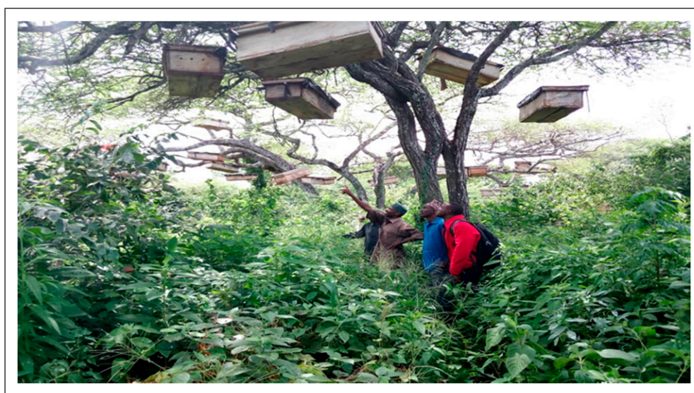
Figure 2. An apiary with hanging frame beehives covered by vegetation.

adoption of the hanging frame hives technology in the region. Moreover, many factors were contributing to community preference for log beehives. The focus group discussions revealed that hanging frame beehives were expensive compared to log beehives. A hanging frame beehive was priced from TZS 80,000 to TZS 120,000 (34.45–51.68 USD), which hindered beekeepers from adopting and using the technology. Apart from the perceived high costs of hanging frame beehives, tradition was another important aspect mentioned during discussions. It was further revealed that tribes such as Sandawe and Rangi preferred to use log beehives due to their cultural values and norms, such that traditional beekeeping is a way of honouring ancestors. The system has become part of their daily family life, making it difficult to adopt hanging frame beehives as it will go against their norms. These ethnic groups are