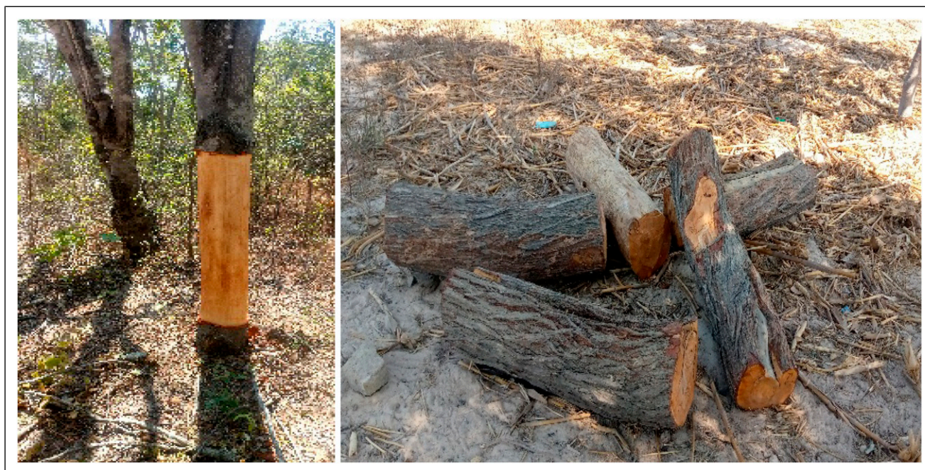
Figure 3. Debarking and cutting down trees for log or bark beehive construction.