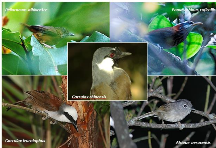
Fig. 3. Species of Timaliade used in this study.

Another important finding of our study is that only 14-20% of predicted distributions overlap with protected areas, assuming that the land within these distributions inside protected areas is protected. Although these areas have been deemed "protected," Vietnam's management of national parks and nature reserves is centralized, creating a complex, bureaucratic system of administration in which the managing of the forests often falls into the hands of local and provincial authorities [30]. The effectiveness of these measures within parks and protected areas continues to be compromised by the large number of individuals living legally within the borders of these forests as well as the high levels of agriculture and human activity in close proximity to these regions. Poaching, logging, and resource acquisition from these protected areas are a major issue. Many populations and species abundances throughout Vietnam have declined dramatically since the end of the U.S.-Vietnam war, some even to extinction, due to these pressures [30–32].