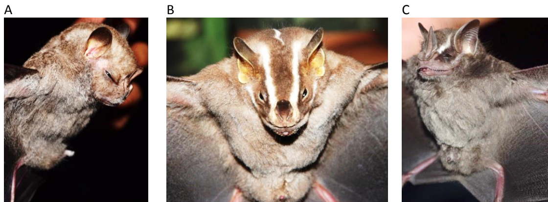
Fig. 3. (A) Salvin's Big-eyed Bat ( Chiroderma salvini ), (B) Heller's Broad-nosed Bat ( Platyrrhinus helleri ) and (C) Thomas's Fruit-eating Bat ( Artibeus watsoni ).