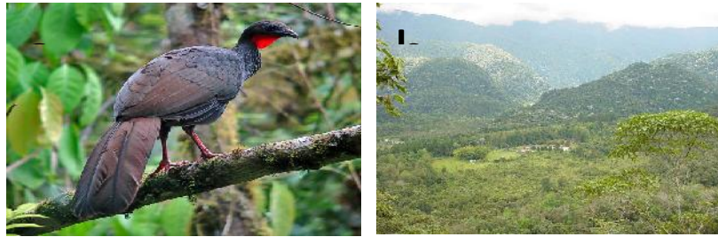
Fig. 1. Cauca Guan, Penelope perspicax ; photo by Pete Morris/Birdquest, with permission (a); Otún River watershed on the Central range of the Colombian Andes, with the Otún Quimbaya Flora and Fauna Sanctuary facilities in the middle; photo by Gustavo Kattan (b).