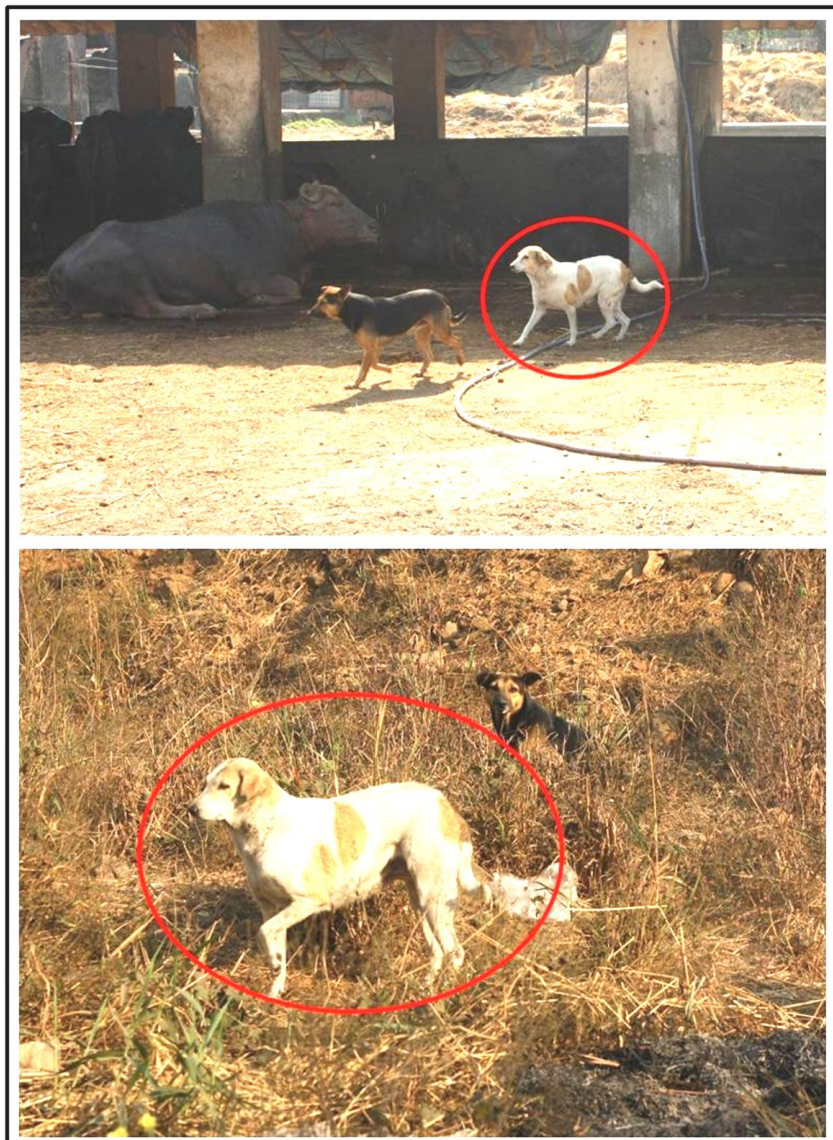
Fig. 2. The image indicates photographs obtained for a distinct naturally marked dog over two secondary sampling intervals in Aarey Milk Colony, India.

[34]. This is similar to Bowden's estimator in the NOREMARK program [24]. As marks were individually identifiable, we used individual heterogeneity models with the data, since we expected individual dogs to have differential sighting probabilities. We used the time-constant models, with or without individual heterogeneity parameters. Since some convergence issues occurred for values of \sigma (individual heterogeneity parameter) for the time-constant model with heterogeneity, we manually supplied initial values covering the probable range of parameters in the three models. We also used other options to overcome convergence issues for values of \sigma , such as the 'Alt.Opt.method' and 'Do not standardize design matrix' in another two models. In all we used seven time-constant models, the first six of which represented the time-constant model with individual heterogeneity, with various options as described above. The last model represented the time-constant model without the individual heterogeneity parameter (where \sigma was fixed to zero). Model comparison was performed in an information-theoretic framework using Akaike's information criteria corrected for small sample size (AICc).