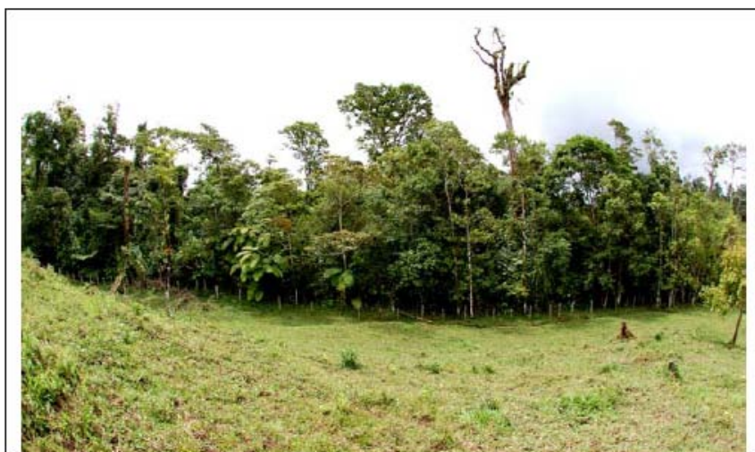
Fig. 1. Typical physiognomy of the type of abrupt forest-pasture edge in the Coto Brus landscape

neotropical montane forest). In this study, we analyze forest structure and composition along the edge-interior gradient in a tropical montane fragment to determine whether there is an interaction between gaps and edges. Specifically, we address the following questions: (1) Do edges interact with gaps and further reduce canopy cover at the fragment's periphery? (2) What are the separate effects of distance to edge and canopy openness on structural (stem density and basal area) and biotic (species richness, species composition) response variables? (3) Do different species guilds (pioneers, shade tolerant) show differential responses to these effects? It is particularly important to address these questions in tropical montane forests, because they have been severely fragmented, and are likely to remain so. By analyzing the relative importance of edge effects and canopy openings on tree communities, this study aims to provide better insight into how to address the conservation of neotropical montane forests.