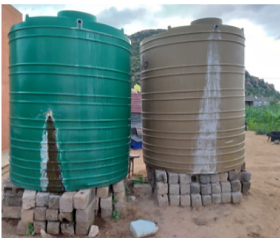
Figure 2. Jojo tanks used for storage of municipal borehole water at Setumong, ga-Matlala.