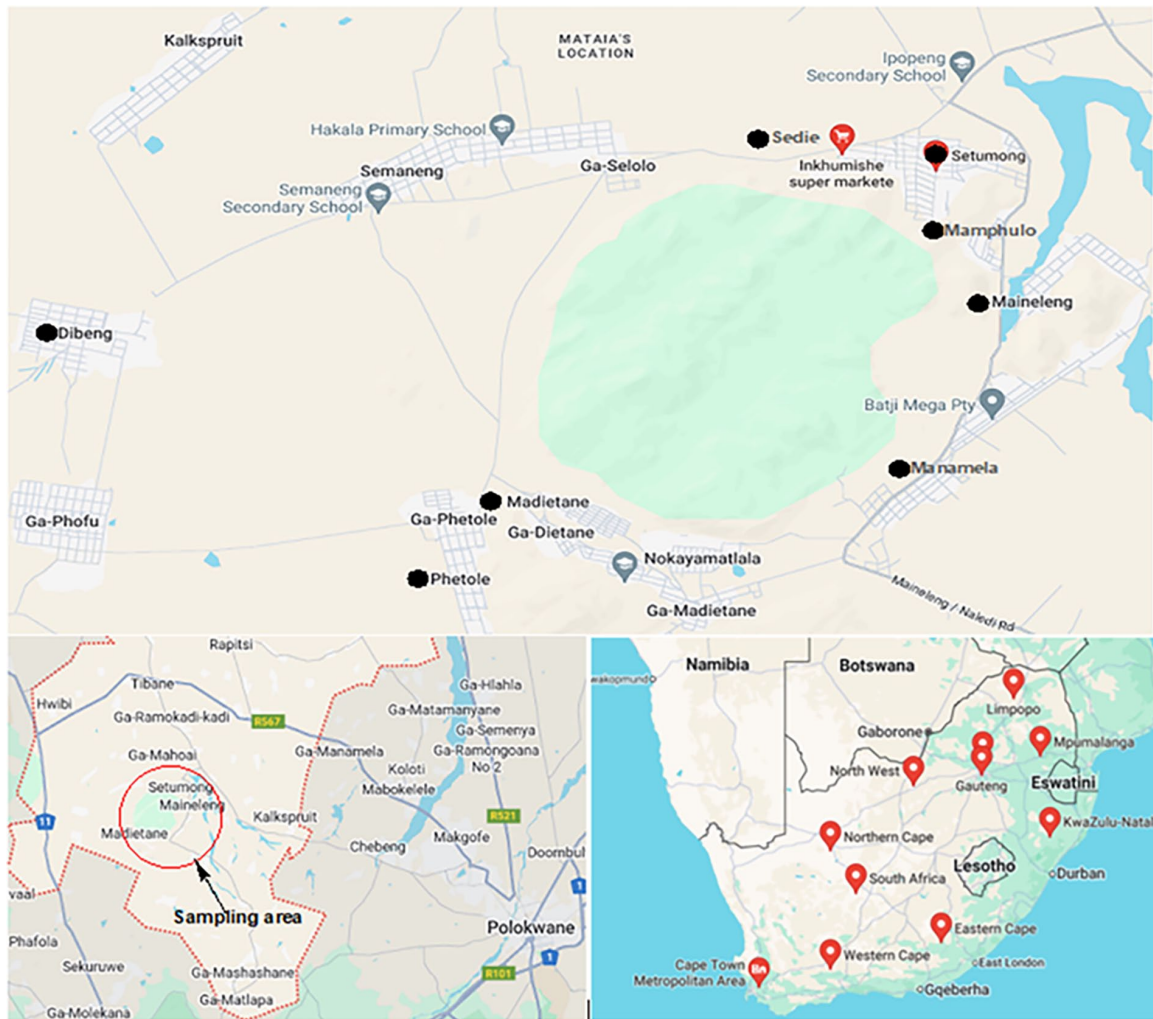
Figure 1. Map of the sampling area in Polokwane, Limpopo Province, South Africa.