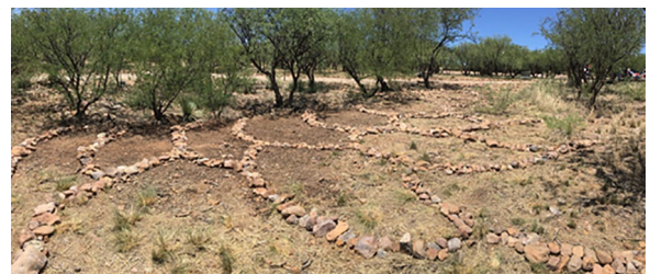
Image 8. Before image of Fishscale structure built on eroding slope.

In 2018, representatives from Baboquivari High School, Tohono O'odham Community College, and the Tohono O'odham Nation—a desert Indigenous community located along what is today known as the U.S./Mexico border—visited