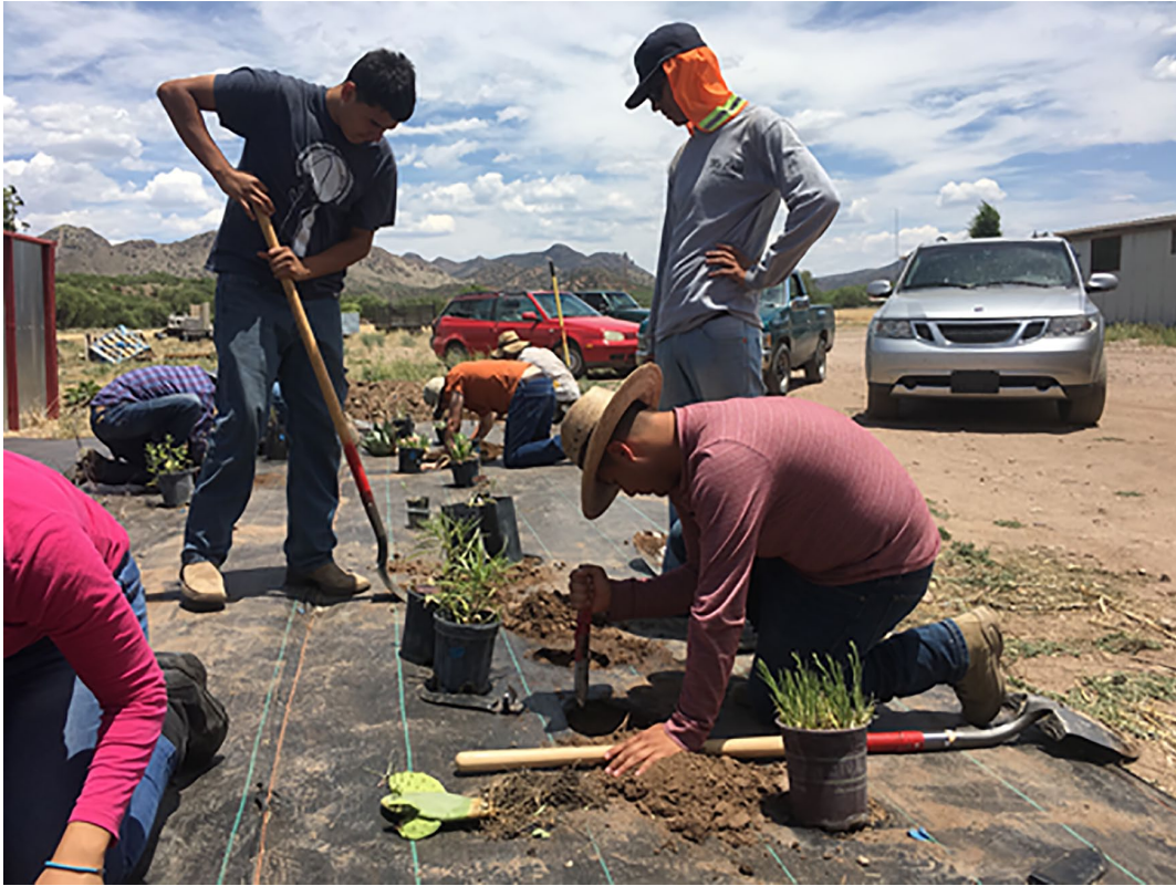
Image 5. BECY crew planting native flowers at Patagonia Flower Farm.