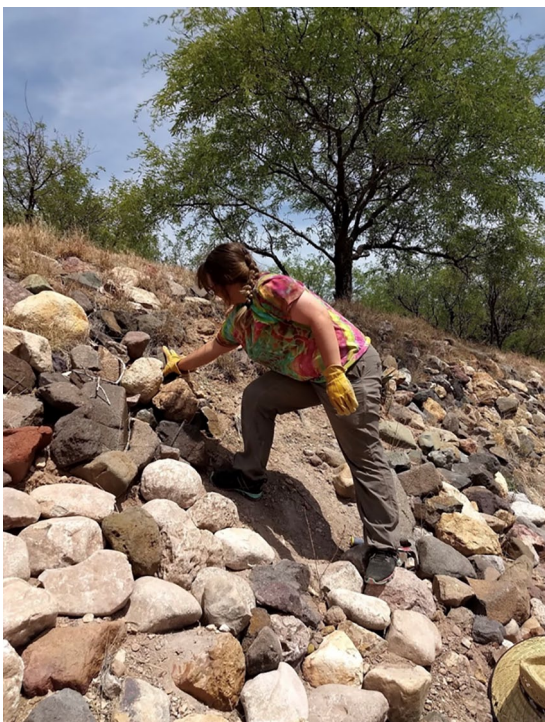
Image 2. BECY team member with rock structure.

During the summer of 2019, BECY Institute celebrated the eighth year of programming. Since it began, BECY interns have built more than 2,000 erosion control structures across three