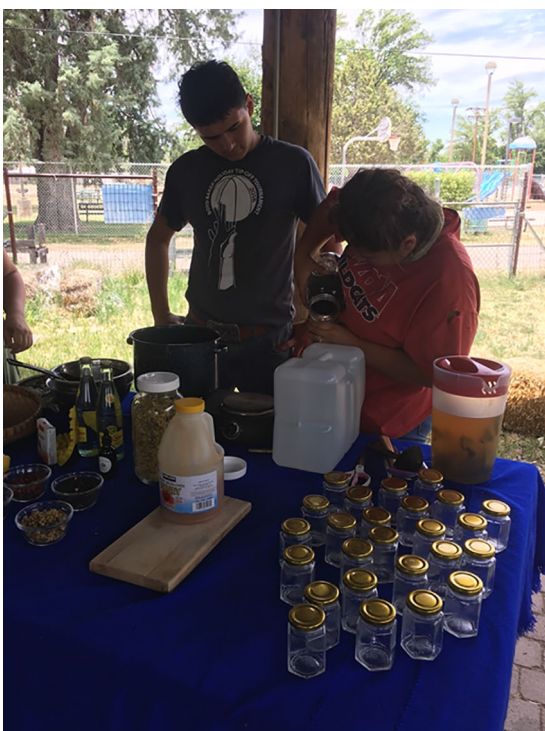
Image 4. BECY crew making immune-boosting elderberry syrup.

And BECY graduates in Douglas are now pursuing livelihoods in land conservation and restoration.