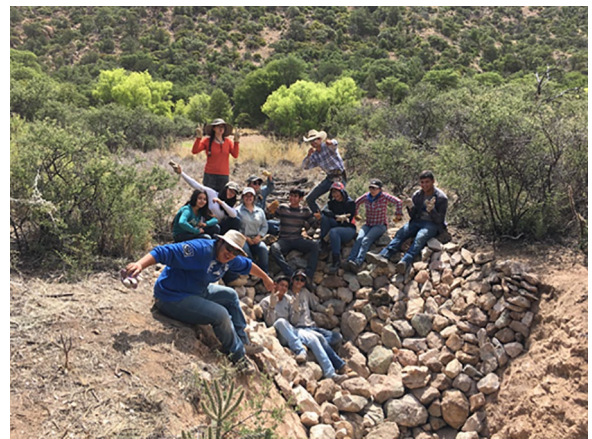
Image 7. BECY with giant Zuni bowl in Dragoon Mountains of Arizona.