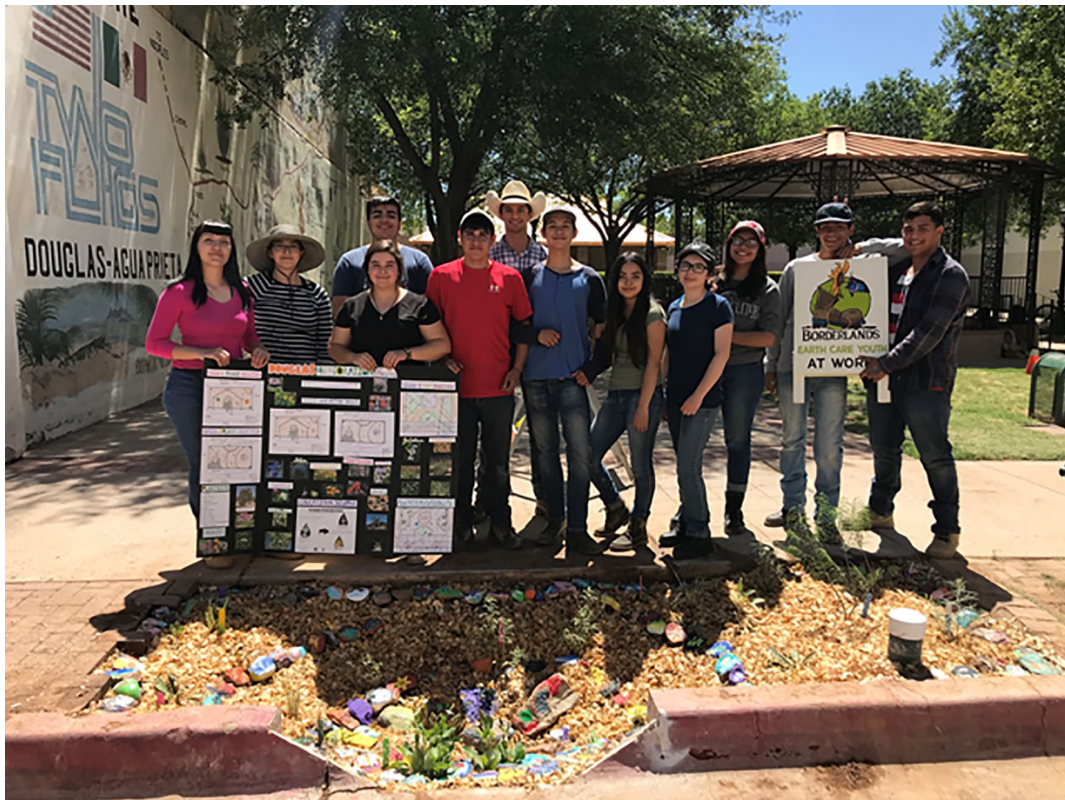
Image 3. BECY crew at infiltration basin in Douglas, Arizona.