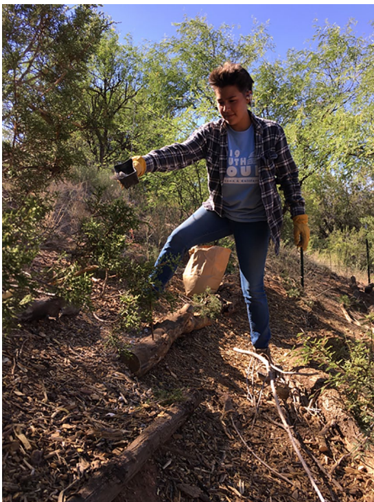
Image 6. BECY crew casts grass seeds on private ranch.