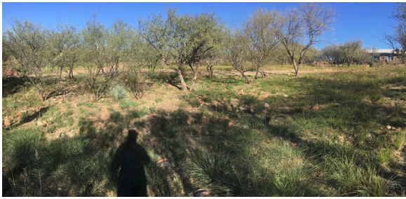
Image 9. Fishscale structure built on eroding slope, 1 year later. Grasses have returned and rocks are barely visible.

School staff to pilot an after-school program that hired Tohono O’odham students to work alongside conservation professionals, designing and installing a rainwater-harvesting native plant and heritage food garden on campus. This program, called Şu:daḡi ‘O Wuḡ Doakag , O’odham for “Water is Life,” was designed for Tohono O’odham youth to earn valuable skills, training, and work experience. During the 2018/2019 pilot program, youth worked hard to improve their campus, build habitat for native pollinators, harvest precious rainwater, and sow seeds of hope for future generations of youth. Participants were presented the Stewardship Award at the annual Tohono O’odham Earth Day festival hosted by the Tohono O’odham Environmental Protection Office. A second year of Şu:daḡi ‘O Wuḡ Doakag began in the fall of 2020, led by Tohono O’odham Community College students with mentorship and curriculum development by BRN staff. And simultaneously, BRN has been approached about developing youth restoration programming in the Mexican border city of Agua Prieta, Sonora. Along with healing landscapes, restoration can heal cultural relationships.