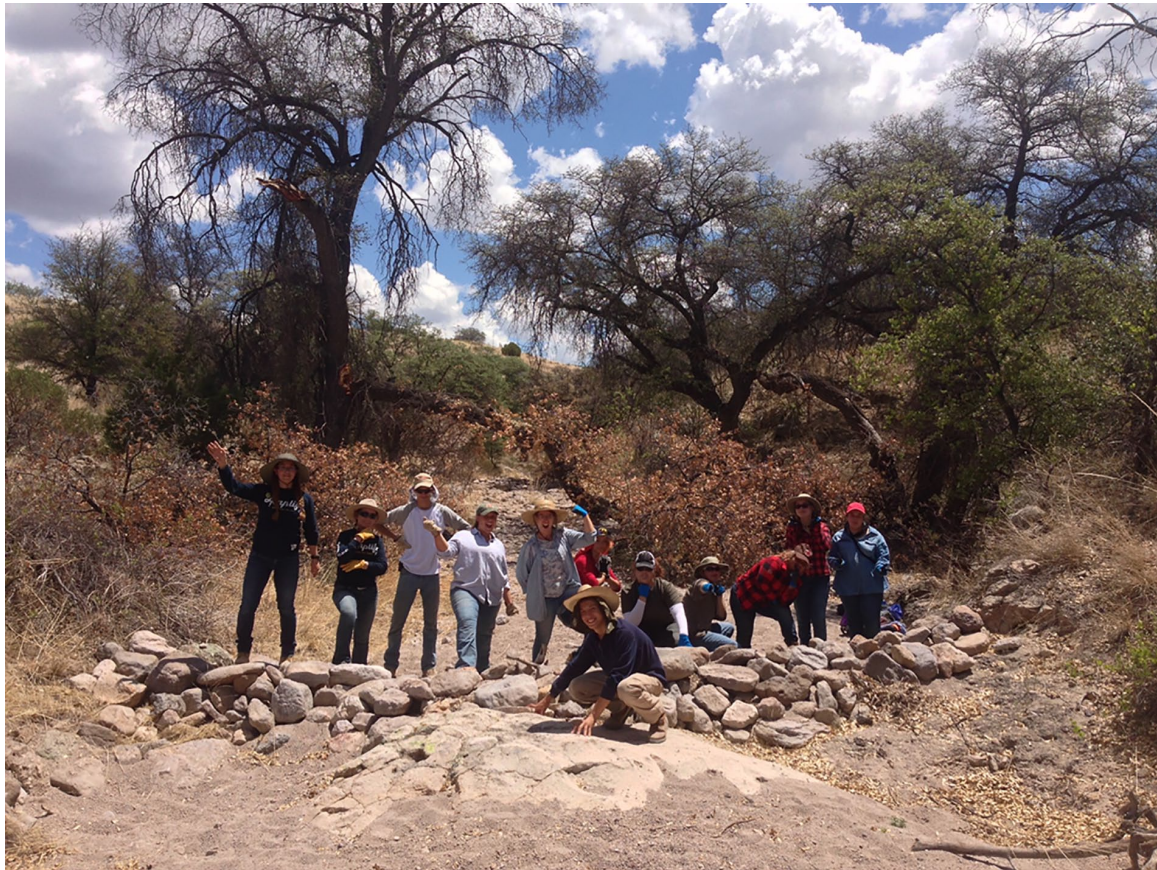
Image 1. BECY crew with rock structure.