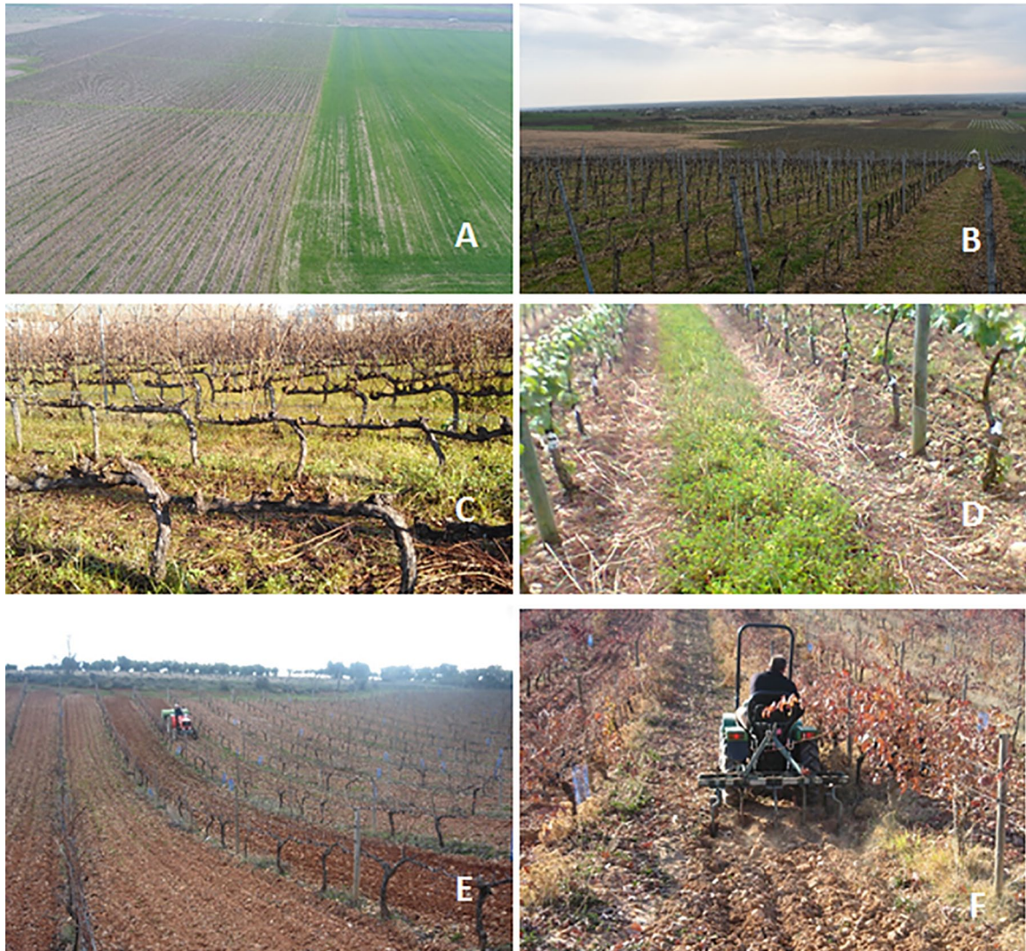
Figure 1. Panoramic overviews of all the study areas: (A and B) Vineyards in Eastern Croatia. (C and D) Vineyards in north-central Portugal. (E and F) Vineyards in Central Spain.

were the necessity to develop proper site-specific management plans to avoid water shortages and that cover crops can be recommended for soil protection in semi-arid environments. These results complete previous results obtained in other pioneer investigations conducted by this group in this region 17,18 or when compared with other European vineyards. 19